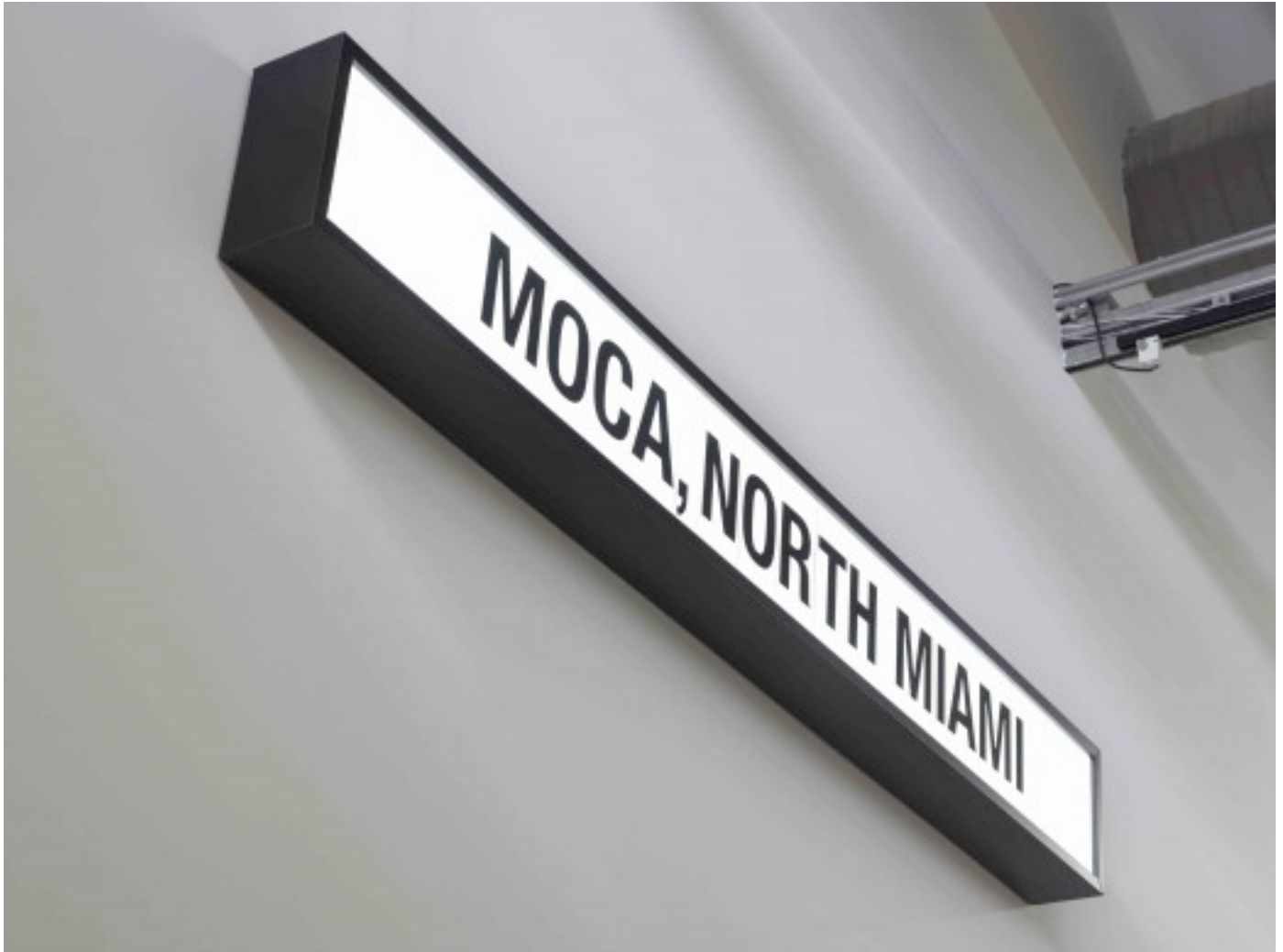
Virginia Overton, Untitled (MOCA, Nort Miami) , 2014. Painted aluminum, acrylic, electric wiring, 12 x 96 x 6 inches.

RAIL: Because it doesn't have to keep the cow in.