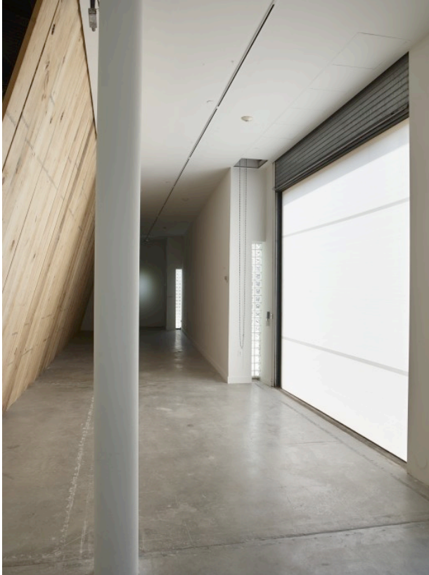
Virginia Overton's Untitled (lean-to-South) (left) and Untitled (Moca's rollgate fashioned into a lightbox).

RAIL: Like the fountain, the works in the main gallery address circulation and movement. For one, the lean-to sculpture creates a darkened hallway that forces visitors forward into the gallery and past the museum's architecture. Internally, the works seems to point to one another. That happens with the fountain as well—each line seems to point as it moves the water forward.