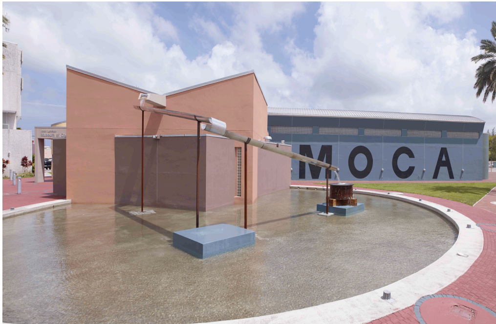
Installation view of Virginia Overton's Flat Rock at MOCA, North Miami.

Miami Rail Virginia Overton By Christy Gast