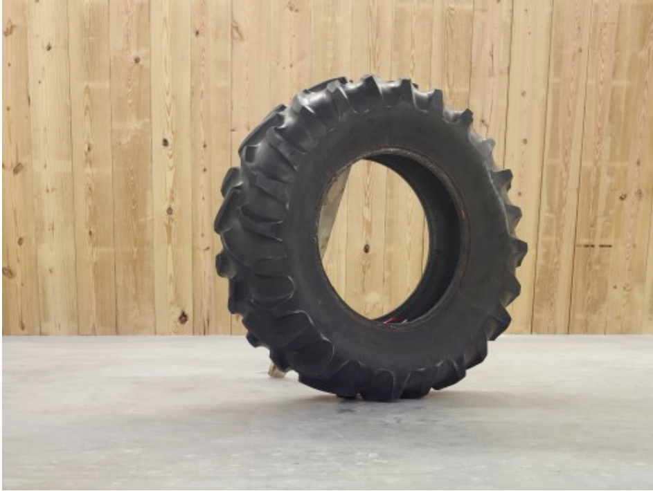
Virginia Overton, Untitled (Good Year) , 2014. Tractor tire, wood, car battery, inverter, white-noise machine. 57 x 57 x 57 inches.

RAIL: A lot of your work involves precariously stacked, leaned or suspended materials creating structures that depend in part on the architecture of the exhibition space for their structure. They seem unstable, one false move and all the pieces could fall to the floor with a powerful racket, yet they are often monumental in scale. Some refer to this tension as “poetic.” I wonder what that means.