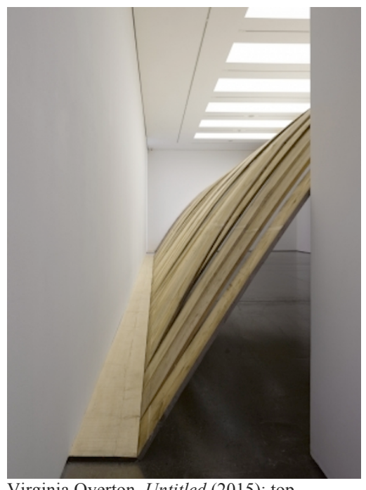
Virginia Overton, Untitled (2015); top, left

For this exhibition, Overton created site-responsive works using locally sourced and recycled materials, ranging from wood and metal to