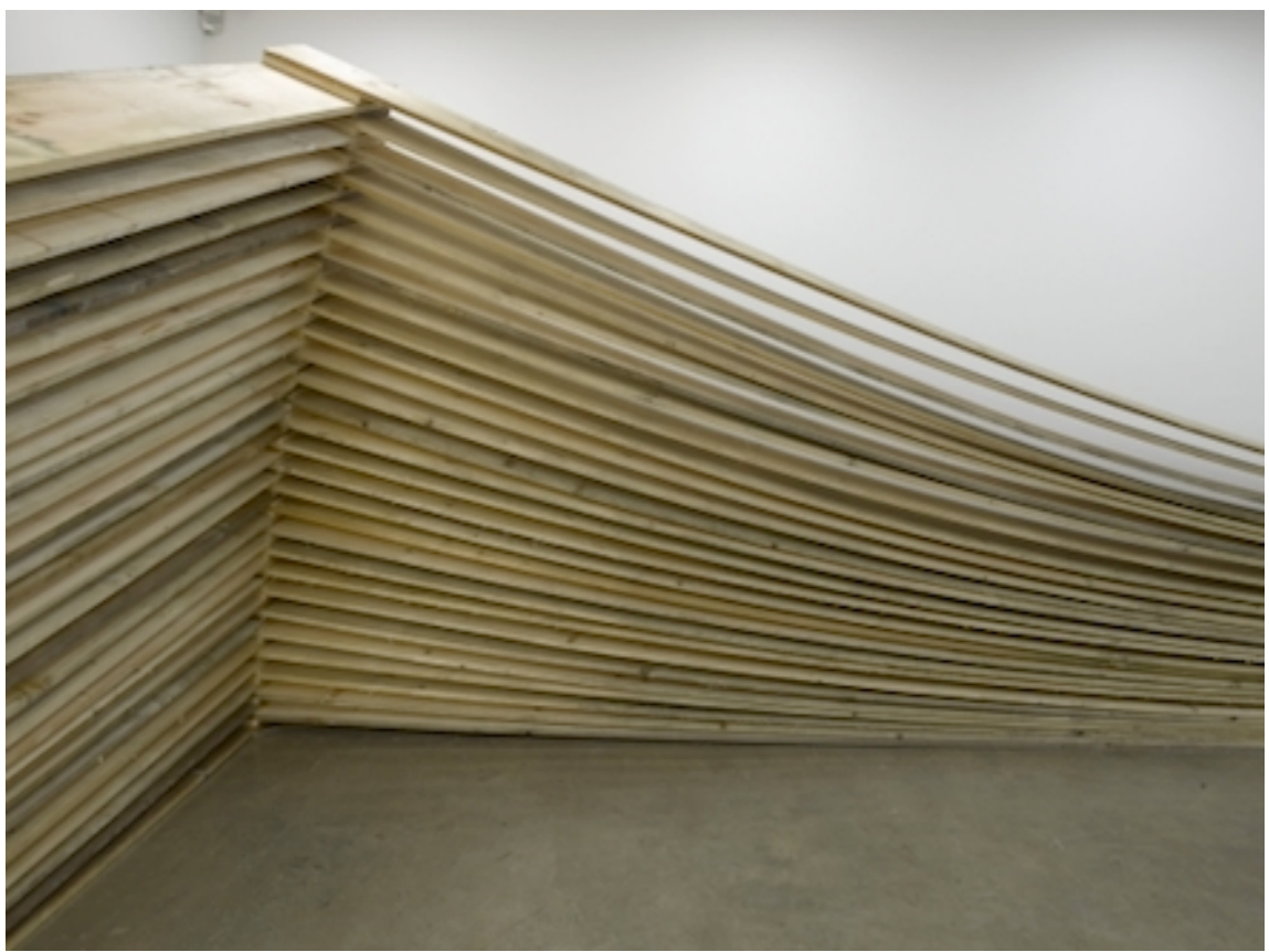
Virginia Overton, Untitled (2015), all images courtesy White Cube

On view in London at White Cube in Mason's Yard is an exhibition of new large-scale minimalist sculptures by American artist Virginia Overton. The exhibition is Overton's first in the UK.