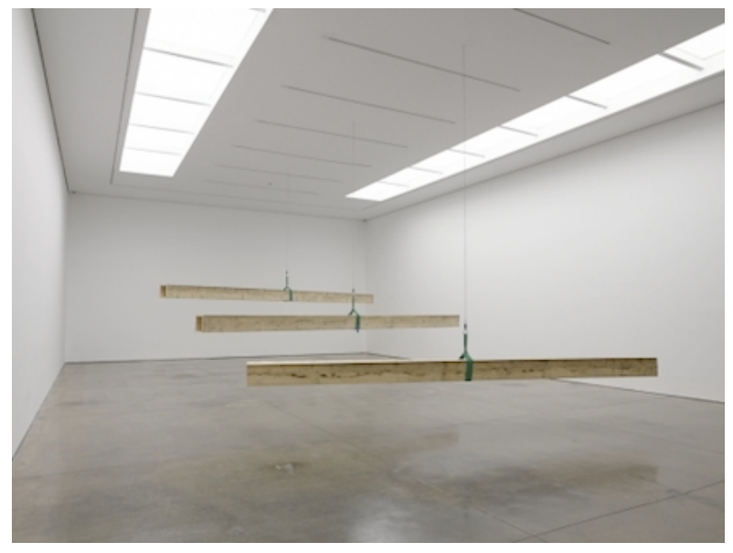
Virginia Overton, Untitled (2015)

The current exhibition at White Cube Mason's Yard will continue through March 14th.