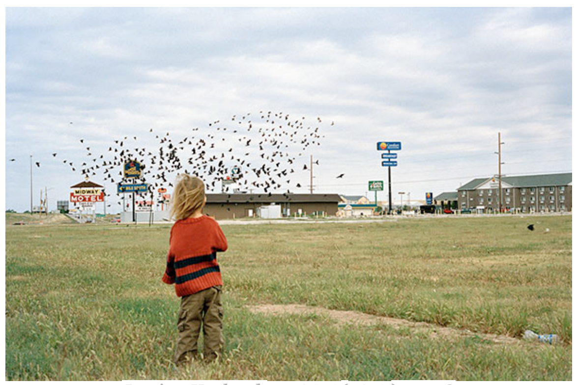
Justine Kurland, Untitled (Birds), 2008

Kurland: What do you think overall of the book? Would you do anything different if you could?