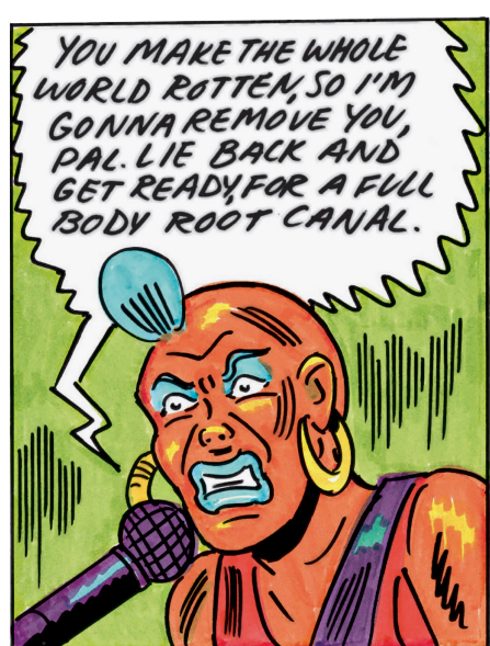
Clockwise, from left: Justine Kurland, After Darius, 2010, C-print, 30 × 40". Edward Burtynsky, Salt Pans #9, Little Rann of Kutch, Gujarat, India, 2016, C-print, dimensions variable. Page detail from Anya Davidson's Band for Life (Fantagraphics Books Inc., 2016).