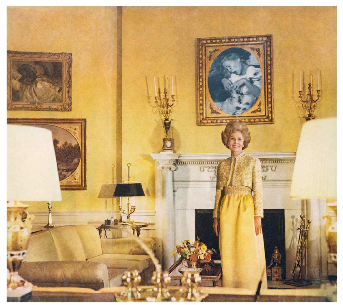
Martha Rosler, First Lady (Pat Nixon), from the series House Beautiful: Bringing the War Home, (around 1967-72)<sup>©</sup> Martha Rosler. Courtesy of the artist, Mitchell-Innes & Nash, New York and Galerie Nagel Draxler, Berlin/Cologne

Democrats have relied on highly educated professional-class voters and idealistic celebrities to support them electorally, and increasingly on what the Republicans have denounced as identity politics, aiming to empower people beset by social stigma and campaigns of vilification and even criminalisation: African Americans and LGBTQI people, but also (of course) women, and Latinx, and more recently, Asian, South Asian, Native American, and refugee populations. The party has also made efforts to create universal health care and to raise educational and economic levels.