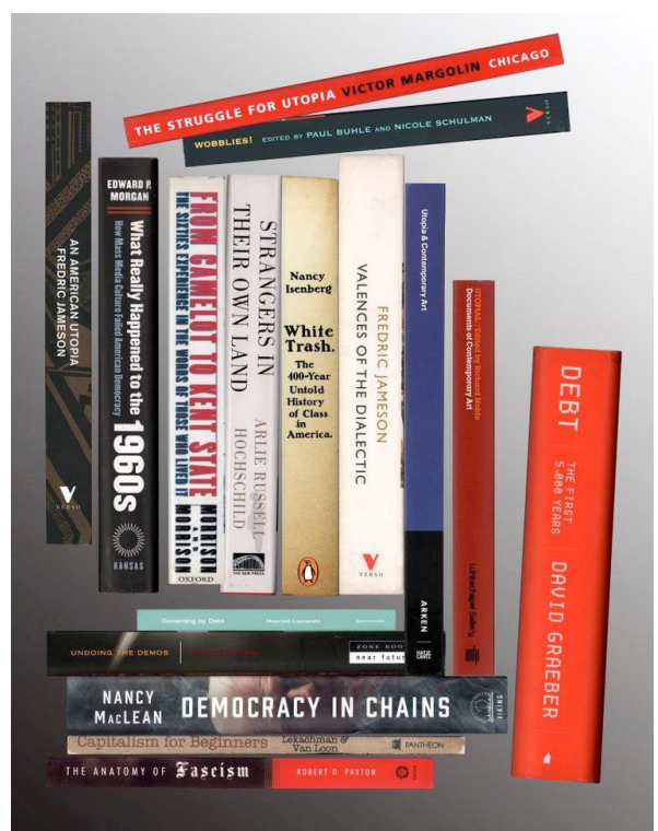
Martha Rosler, Capitalism, Democracy (2018), from the series Off the Shelf (2008-18)

Demographic and labour shifts in the US have produced well-educated city dwellers and suburbanites with professional and other middle-class jobs. But the movement of people to cities has left behind large regions with many poor and working-class white residents with at most a high-school education. Up until the late 1960s, they were generally securely employed, often in factory work.