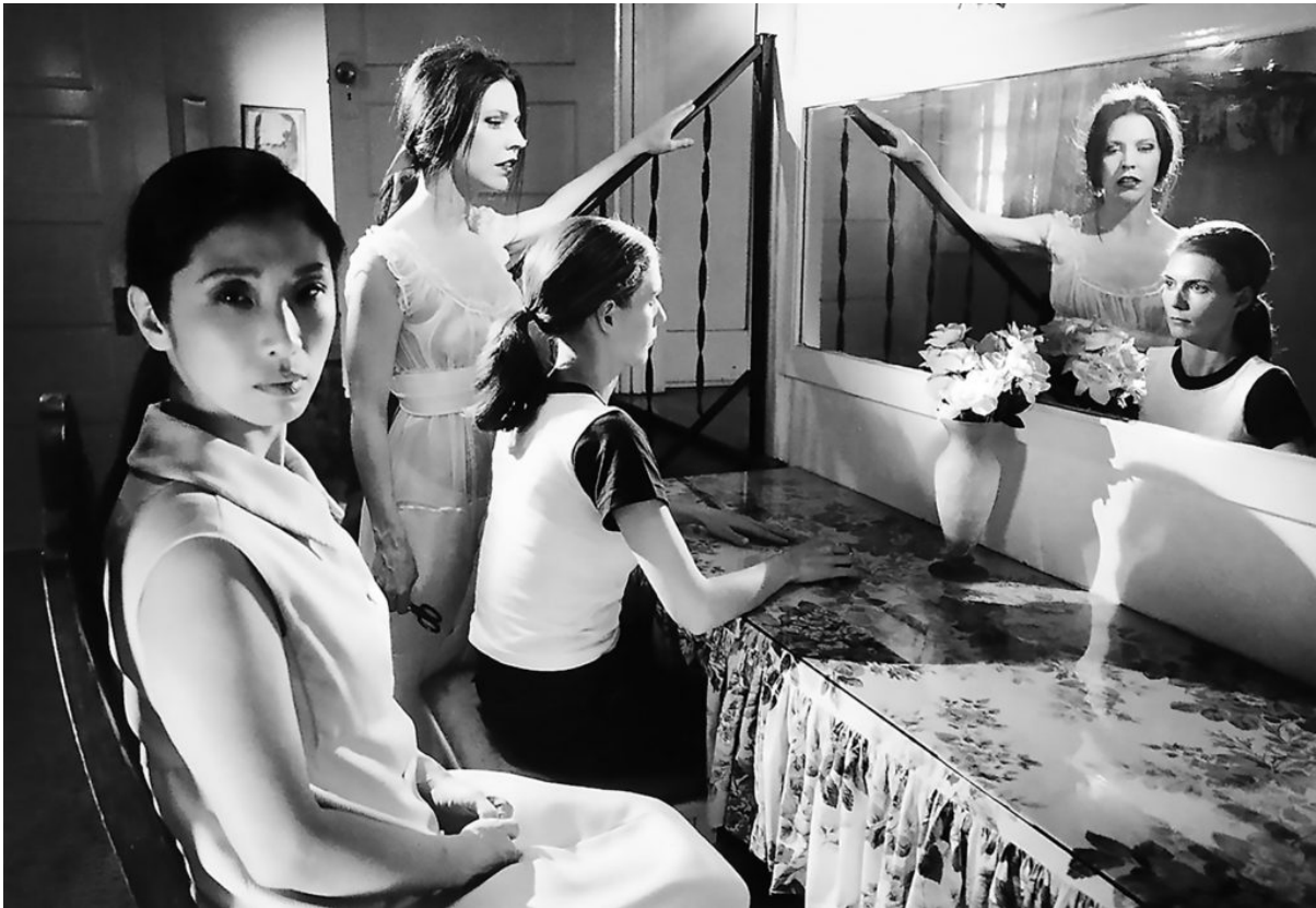
Catherine Sullivan, production still from Five Economies (Big Hunt) , 2002. 16mm film converted to digital media, five channels, black and white, 20 min. loop

Pope.L: The "What can be Black art?" question is the same question art has been asking since art began, meaning: "What is possible in art?" Maybe that's the only question, because based on the answer, it will engage all sorts of encounters. And race? Well, maybe that's just another question within the question.