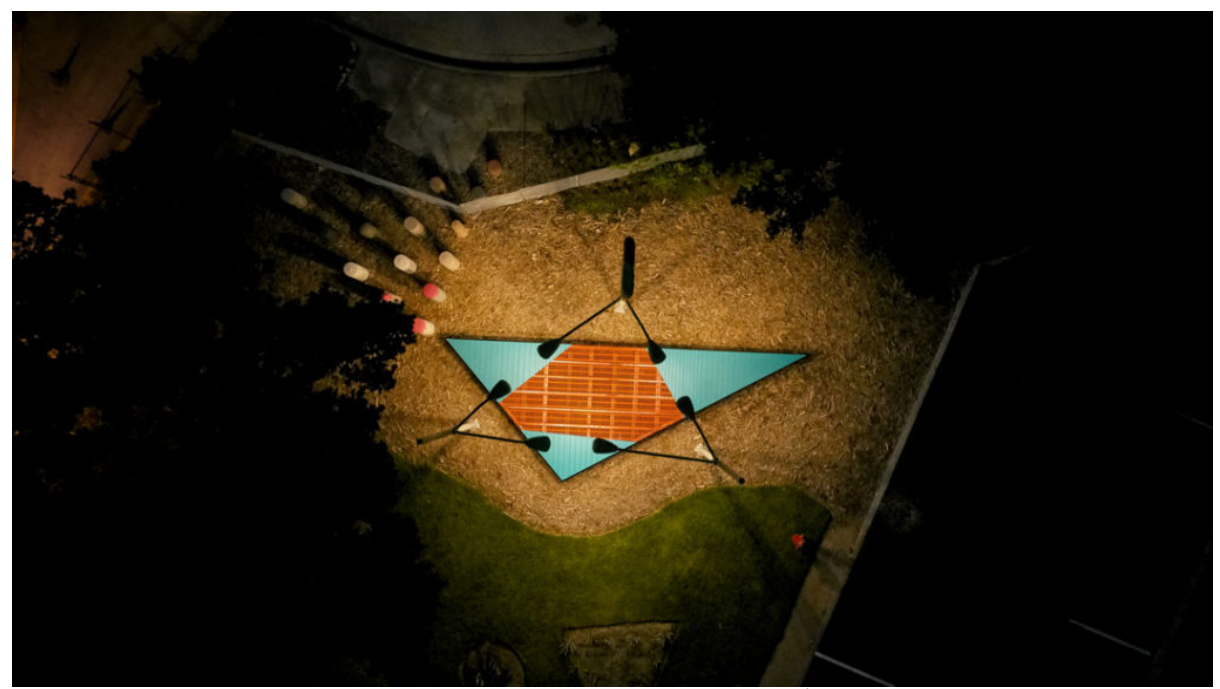
Jessica Stockholder, installation view of Save on select landscape & outdoor lighting: Song to mind uncouples , 2019. Powder-coated aluminum lamp poles with LED heads, poured and painted green epoxy resin and acrylic urethane; fiberglass outgrowth; concrete bollards with poured pink epoxy resin; orange fiberglass grating, turquoise plastic lumber, and steel joists; and landscape, dimensions variable. The Contemporary Austin – Laguna Gloria

Stockholder: I did that without thinking about it. I understand that there are conventionally masculine and feminine ways of making, and I'm aware of those meaning tags being applied to the work. Even so, I feel that the things I make are in dialogue with all kinds of people's work. Like you say, there are losses. I never wanted to be known as a woman artist. People like to discuss my use of domestic objects, and as soon as that question is asked of me, I know that they're going down the woman path, proposing that somehow domesticity is a woman's thing. That's a pile of crap. We all live in domestic situations. I won't go there.