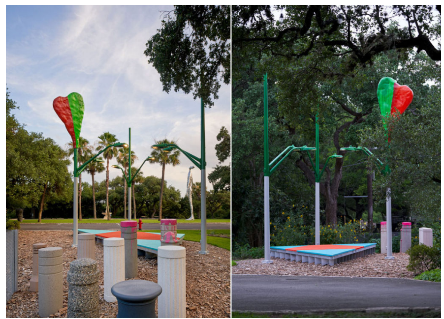
Jessica Stockholder, installation views of Save on select landscape & outdoor lighting: Song to mind uncouples , 2019. Powder-coated aluminum lamp poles with LED heads, poured and painted green epoxy resin and acrylic urethane; fiberglass outgrowth; concrete bollards with poured pink epoxy resin; orange fiberglass grating, turquoise plastic lumber, and steel joists; and landscape, dimensions variable. The Contemporary Austin – Laguna Gloria, photos by Leonid Furmansky

Stockholder: I asked a question about the nature of separation between oneself, the artist, and the world. You went right away to training, which is interesting.