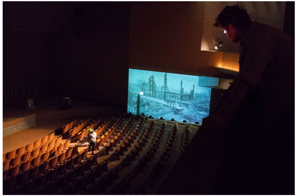
Pope.L, Misses Gaines searches out her darky, Cato, 2018. The Art Institute of Chicago

Pope.L: Yeah. I tell folks: "The project is a shared dream. We all have a part, but there is one goal. I do not know everything about the dream; how could I? But I have some ideas about how to get to our goal. What do you think?" A director's job is not just to point, but to point in an interesting way.