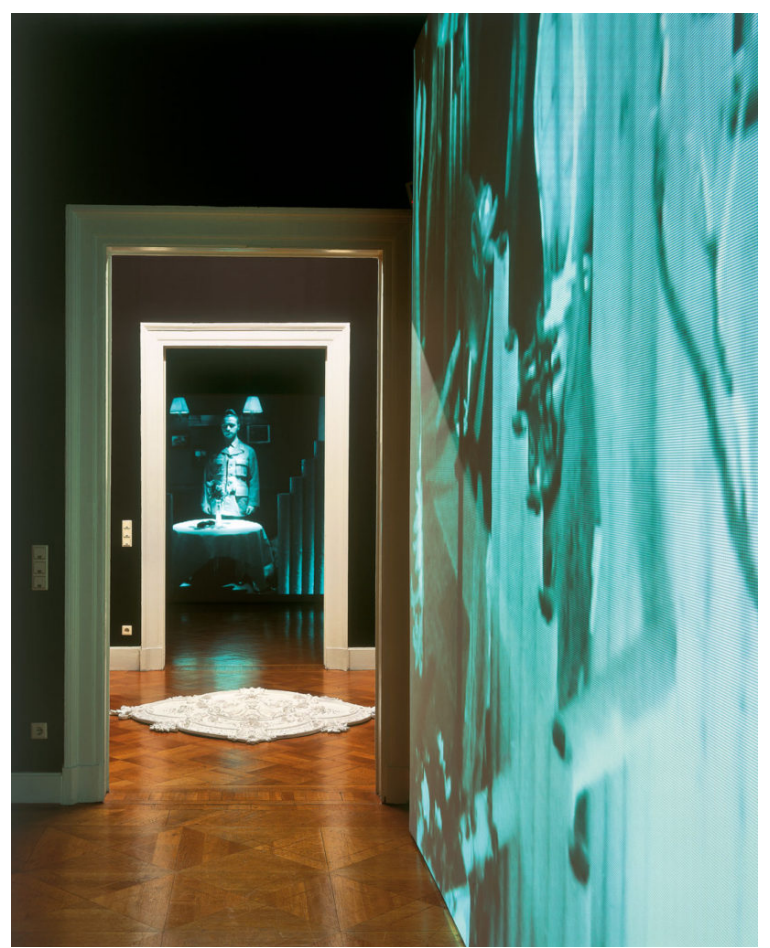
Catherine Sullivan, installation view of Ice Floes of Franz Joseph Land , 2003. 16 mm film converted to digital media, five channels, black and white/sound, 27 min. loop. Kunstverein Braunschweig, Germany, 2004

Pope.L: Little kids get it from the get-go. When they become the tiger, they are the tiger. College students are suspicious of being the tiger. They say, "It has to be meta. Something beyond just being, something more clever." I say to them, "Your meta is getting in the way of your tiger." My students do not trust public pretending.