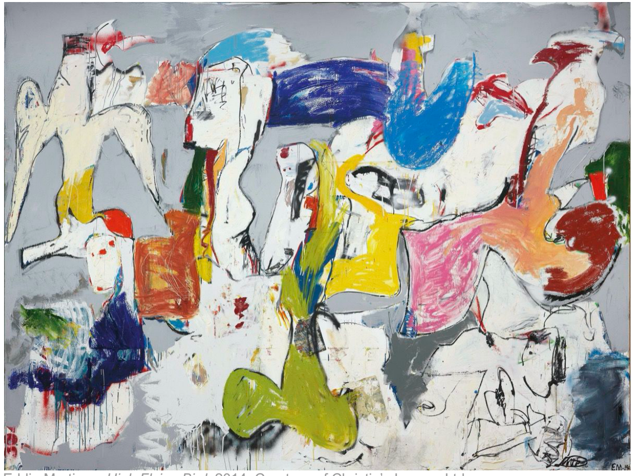
Eddie Martinez, High Flying Bird, 2014.

And even amid the dramatic upswing in works coming to market, his paintings consistently outpace auction house estimates—sometimes by factors of five or more. His current auction record, set last November at Christie's in Hong Kong, is for the 2014 painting High Flying Bird . The work is a 12-foot-wide canvas and features a classic Martinez composition: a parade of colorful, abstract but vaguely anthropomorphic forms—and, yes, a vaguely aviary figure in bright blue—against a thickly painted gray background. Christie's had tagged the work with a presale estimate of HK$1.2 million to HK$1.8 million (US$153,000–$230,000); it sold for HK$15.7 million (just over US$2 million).