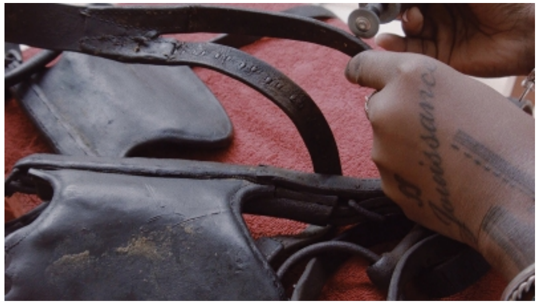
Still from McClodden's I prayed to the wrong god for you , 2019, six-channel color HD video installed alongside twelve objects.