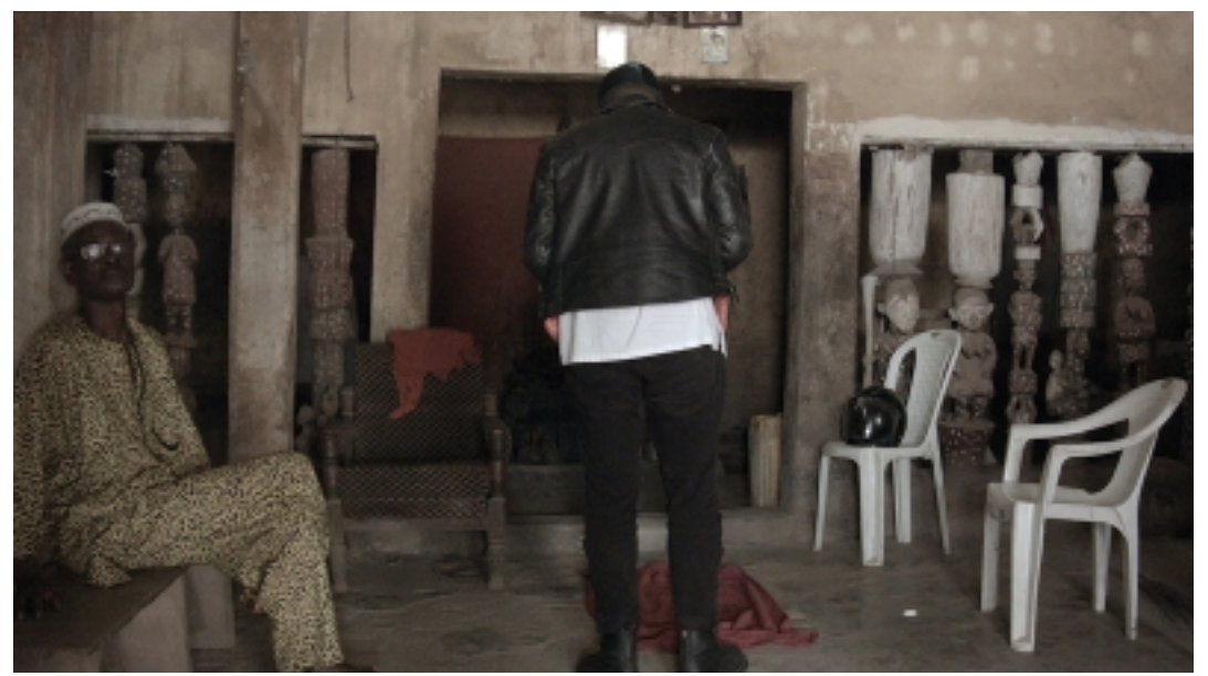
Still from McClodden's I prayed to the wrong god for you , 2019, six-channel color HD video installed alongside twelve objects.

disclose. This tension between concealment and revelation has historically been a part of African art-making. So, you probably have to make judgment calls, even in this conversation, about what you want to disclose, and how accessible, legible, or clear you want to be. How do you approach bringing this refined ritual knowledge that you've carefully cultivated to audiences?