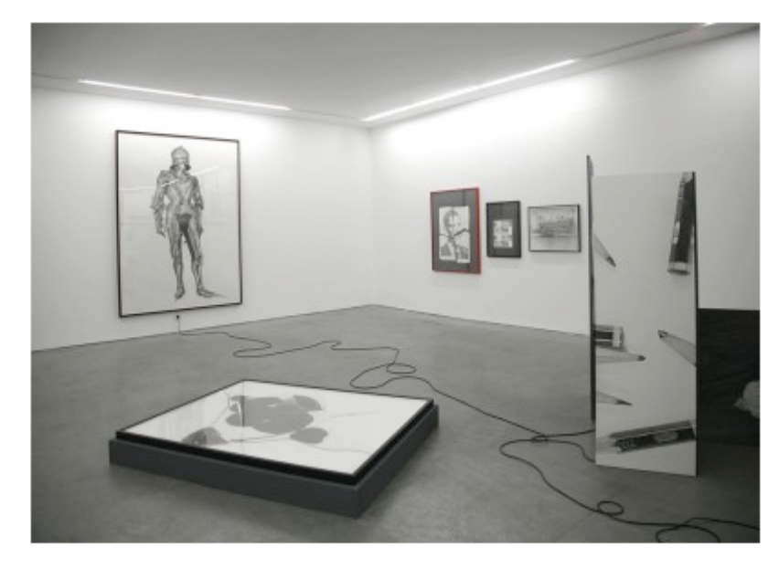
Karl Haendel, Knight #2, 2010, pencil on paper, 103 x 74 in. (261.6 x 187.9 cm), incorporated into an installation of the artist's work, Yvon Lambert Gallery, Paris, 2011(artwork © Karl Haendel)

recognizable as the same knight. Between June 2010, when Haendel first started making the knights, and December 2012, when Longo's "Sir Adam" emerged, Haendel's knight drawings had been shown in Basel, Paris, Naples, New Orleans, and New York.