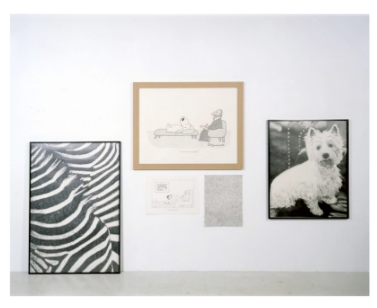
Karl Haendel, Shrink, 2005, five drawings of pencil on paper, dimensions vary (artwork © Karl Haendel)

momentary visual syntax that is liable to be radically transformed the next time it appears. (That is, until a particular grouping enters a collection as a group—but then Haendel can always redraw an image from his slide bank, effectively appropriating himself.) To underscore the radical provisionality of his