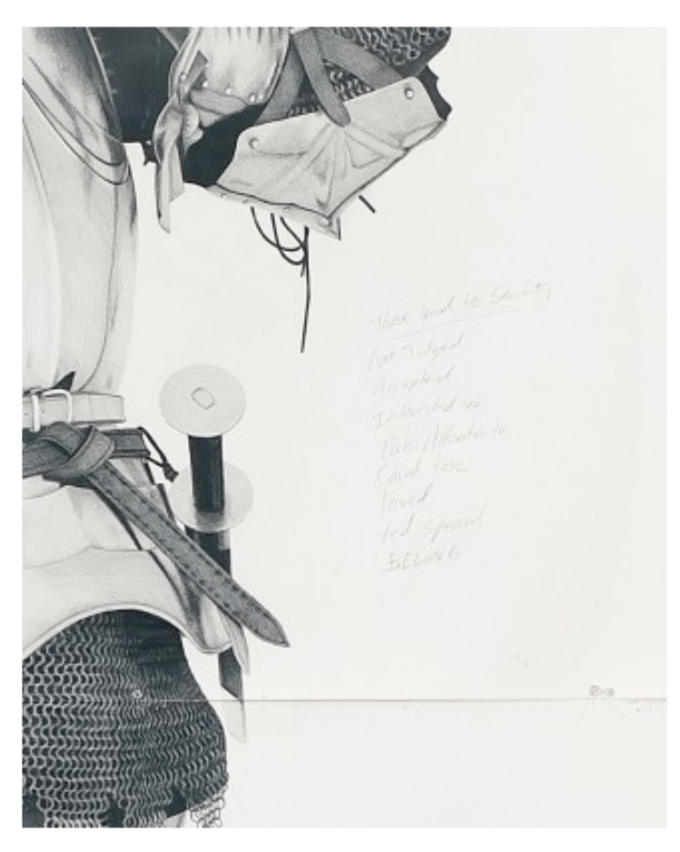
Karl Haendel, detail of Knight #8, 2011, pencil on paper, 103 x 79 in. (261.6 x 200.6 cm) (artwork © Karl Haendel)

meanwhile, stands on nothing; it is set adrift, stranded in the middle of a white page, devoid of all worldly context (as Longo's Men in the Cities had been). Notes from Haendel's therapy sessions scrawled next to other knights in the series further cast them as insecure, pathetic, and emotionally impotent. Next to Knight #8 Haendel has listed feelings that lead to a sense of security: "not judged, accepted, interested in, paid attention to, cared for, loved, feel special, BELONG"—as if the knight