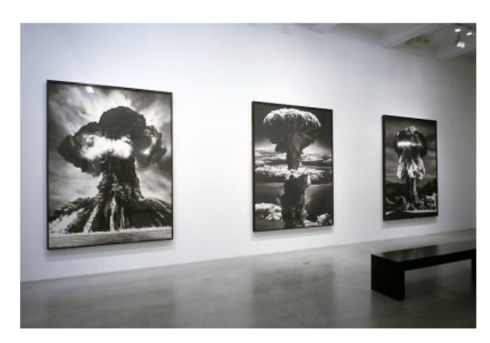
Robert Longo, Sickness of Reason, installation view, Metro Pictures, New York, 2004 (artwork © Robert Longo)

The gesture effectually made some sense of Longo's enigmatic images (now we know why they are falling), which had originally withdrawn their meaning in a characteristically obscure mode of postmodernist