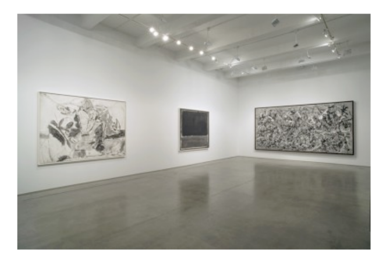
Robert Longo, Gang of Cosmos, installation view, Metro Pictures, New York, 2014 (artwork © Robert Longo)

fashion, in line with a longue durée of modern masters by absorbing their work very literally into his practice. It was an exercise remarkably similar to Haendel's efforts to reconstruct the work of Truitt and to ape the work of Longo—except, crucially, for its lack of conceptual complexity and self-criticality. The 2013 exhibition