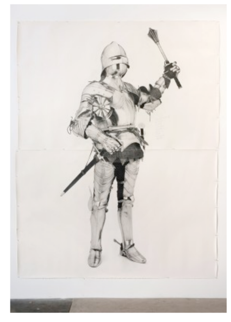
Karl Haendel, Knight #8, 2011, pencil on paper, 103 x 79 in. (261.6 x 200.6 cm) (artwork © Karl Haendel)

and Cindy Sherman— Prince, for one, having been ascribed a "deeply personal vision" that betrays "a uniquely individual logic" this reassertion of authorship is plain to see. xiv If these artists were celebrated in an earlier time for revealing expressionist modes of artmaking to be utilizing, as Hal Foster writes, "a language so obvious we may forget its conventionality and must inquire again how it encodes the natural and simulates the immediate," over thirty years later, in a time when those critical