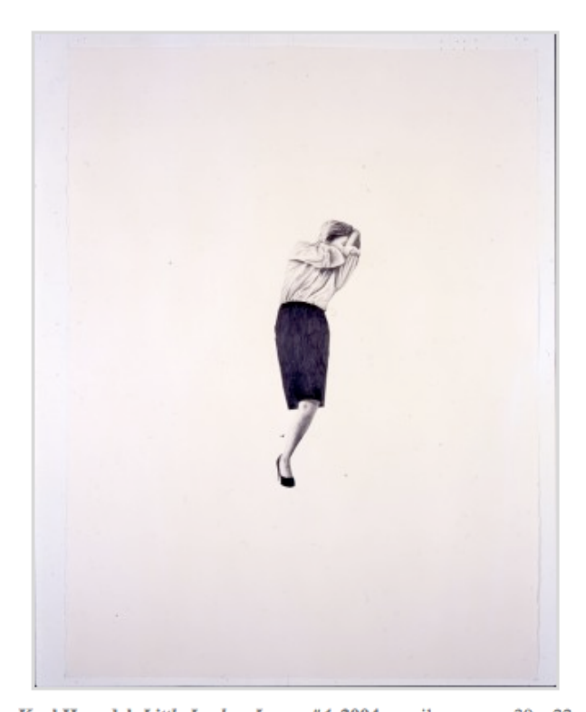
Karl Haendel, Little Legless Longo #2, 2004, pencil on paper, 30 x 22 Karl Haendel, Little Legless Longo #4, 2004 pencil on paper, 30 x 22 in. (76.2 x 55.8cm) (artwork © Karl Haendel)