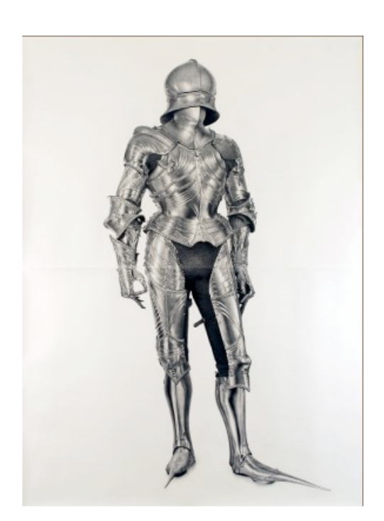
Karl Haendel, Knight #2, 2010, pencil on paper, 103 x 74 in. (261.6 x 187.9 cm) (artwork © Karl Haendel)

Since the rise of appropriation in American art of the 1980s, the strategy has become so commonplace as to evade continued examination as a unique vein of artistic practice. At the same time, recurrent intellectual property battles around appropriative gestures in contemporary art have threatened its viability, giving rise to College Art Association's important report published in