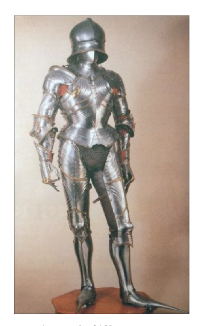
— An example of 16th-century Maximillian armor.

protecting against vulnerability that also delimits experience and feeling.<sup>ii</sup> His first knight was drawn from the only high-resolution image of full-body armor that he could find online. It turns out that finding high-quality images of medieval armor is challenging, not only because authentic full-body metal armor is rare, but also because the armor's reflective surfaces make it. difficult to photograph. Haendel began searching for illustrated books on armor in libraries. He rented a full-body armor suit from a costume shop in North Hollywood specializing in historically accurate re-creations for film and television, and he wore the suit in a 16mm film made in 2010 that is reminiscent of the work of Jack Goldstein. Having