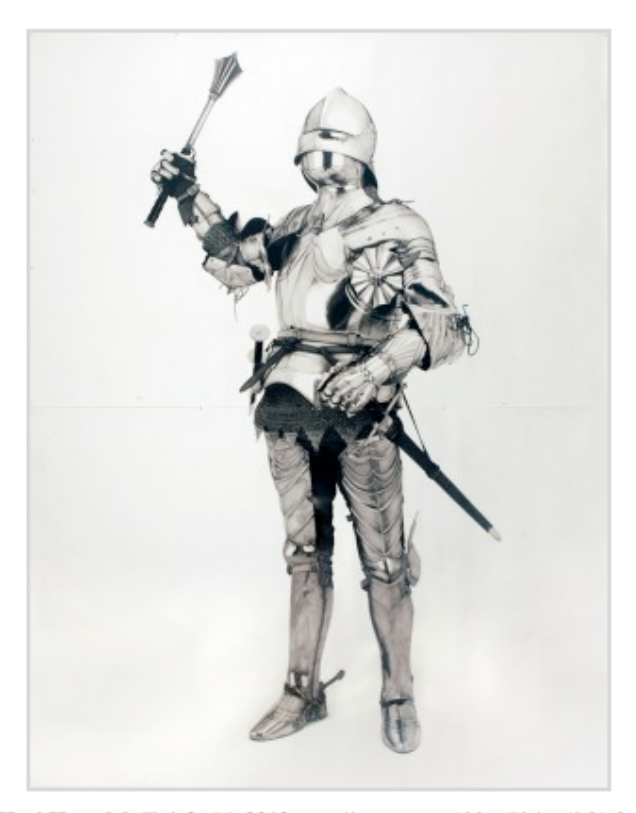
Karl Haendel, Knight #3, 2010, pencil on paper, 103 x 74 in. (261.6 x Karl Haendel, Knight #1, 2010, pencil on paper, 103 x 79 in. (261.6 x 187.9 cm) (artwork © Karl Haendel)