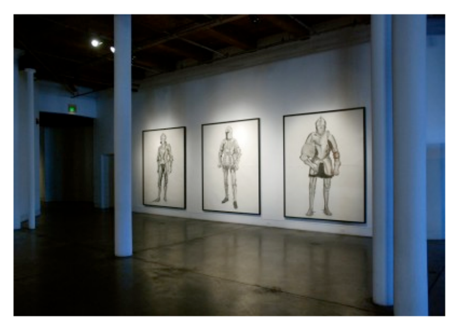
— Karl Haendel, installation of Knight drawings at the Contemporary Arts Center New Orleans as part of Prospect.2, 2011–12. Left to right: Knight #6, Knight #4, and Knight #5 (all 2011) (artwork © Karl Haendel)

acclaimed 2014 series Gang of Cosmos, in which his typical grandiose scale returns. This body of work includes twelve exquisitely rendered graphite drawings of famous Abstract Expressionist canvases, some of which are enlarged even further beyond their already heroic true size. Executed with close access to the paintings, Longo's