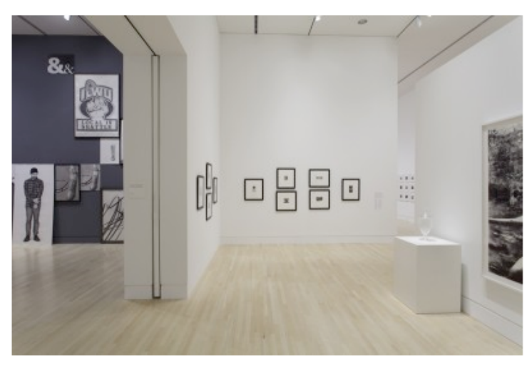
Graphite, installation view showing the work of Karl Haendel (left) and Robert Longo (right) on opposite sides of the same wall, Indianapolis Museum of Art, Indianapolis, Indiana, December 7, 2012–June 2, 2013 (artwork © Karl Haendel; artwork © Robert Longo; photograph provided by Indianapolis Museum of Art)

illustrations of nuclear explosions. The title of the exhibition implied a critique of the ends of scientific rationality, but nevertheless the drawings monumentalized and fixed as elegant each individual scene of destruction, from Nagasaki to Bikini Atoll, as an iconic image for aesthetic delectation. The suggestion of a postmodernist critique of