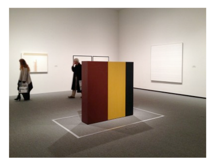
— Anne Truitt's Knight's Heritage, 1963, acrylic on wood, 60-3/8 x 60-3/8 x 12 in. (153.4 x 153.4 x 30.5 cm), installation view, National Gallery of Art, Washington, DC, 2012 (artwork © Estate of Anne Truitt)

Taking Haendel's work as a point of departure and considering the digital turn, the essay as a whole examines how the operations, effects, and reception of appropriation have changed in recent decades and discovers what may be the strategy's longest-lasting politics of signification. "Episode