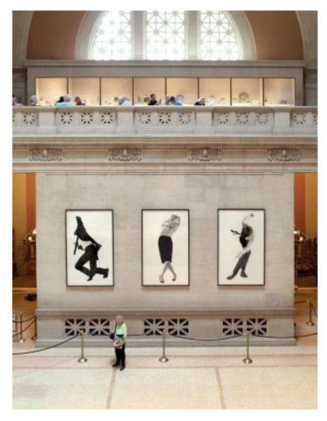
Robert Longo, Men in the Cities (Triptych), installation view of The Pictures Generation, 1974– 1984, Great Hall, The Metropolitan Museum of Art, New York, 2009 (artwork © Robert Longo)

contorts into a bizarre position. With the intent to make a series of similar images drawn as if from film stills, Longo solicited friends to come to the roof of the Manhattan studio building he shared at the time with Cindy Sherman. There, he photographed the smartly dressed men and women as he threw tennis balls at them and pulled on their bodies with ropes so that he could catch their gyrating bodies in positions somewhere "in between dying and dancing."iv Longo transformed the images into drawings in which the bodies are divorced from their original setting, cast afloat in a sea of negative space. If Haendel's work bears similarities to