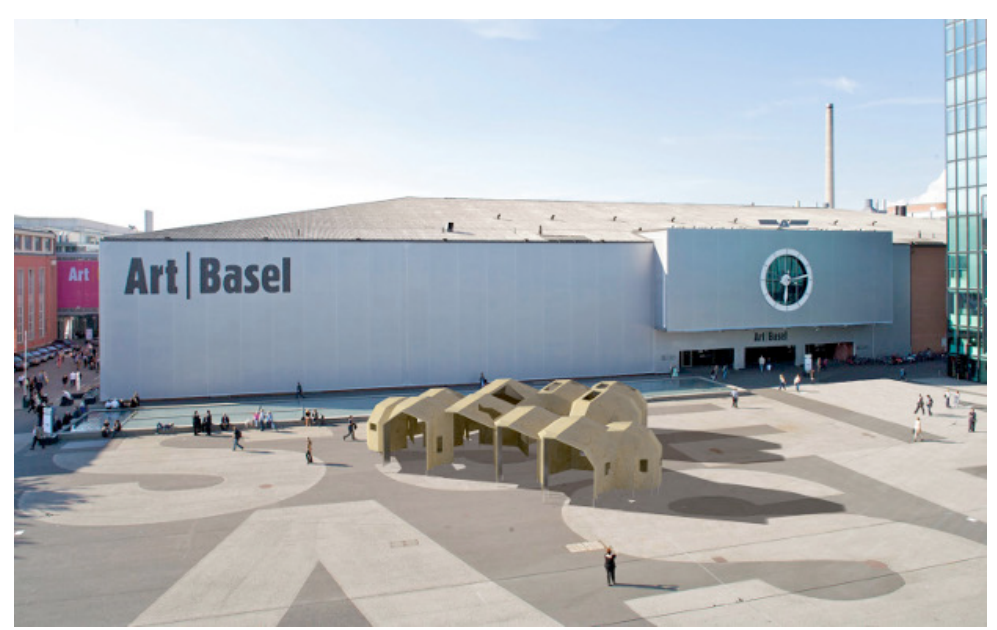
Rendering of Oscar Tuazon's Zome Alloy at Art Basel 2016.

plantains onto the ground, the gorilla enters Unlimited, and wanders through the convention centre, looking for something. The beast drops more white things as it wanders. Eventually, the entity finds what it is looking for: an exhibition space containing a set of paintings called Circa by the famous negro artist Pope.L. The gorilla ignores the paintings and searches behind them, finally extracting five fat stacks of currency. The creature exits, leaving behind a garden gnome painted completely white except for a black-faced nose."