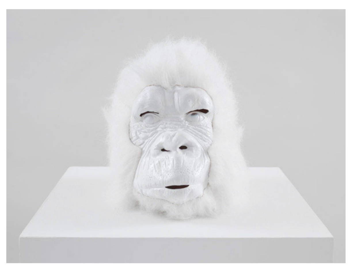
Pope.L, "The Problem, Unlimited, Art Basel," 2016. Courtesy of the artist and Mitchell-Innes & Nash, New York. © Pope.L. Photo: Christopher Burke Studio

A hippy commune, Warhol's dirty drawings and imaginary modernist sculpture also on the menu at this year's fair