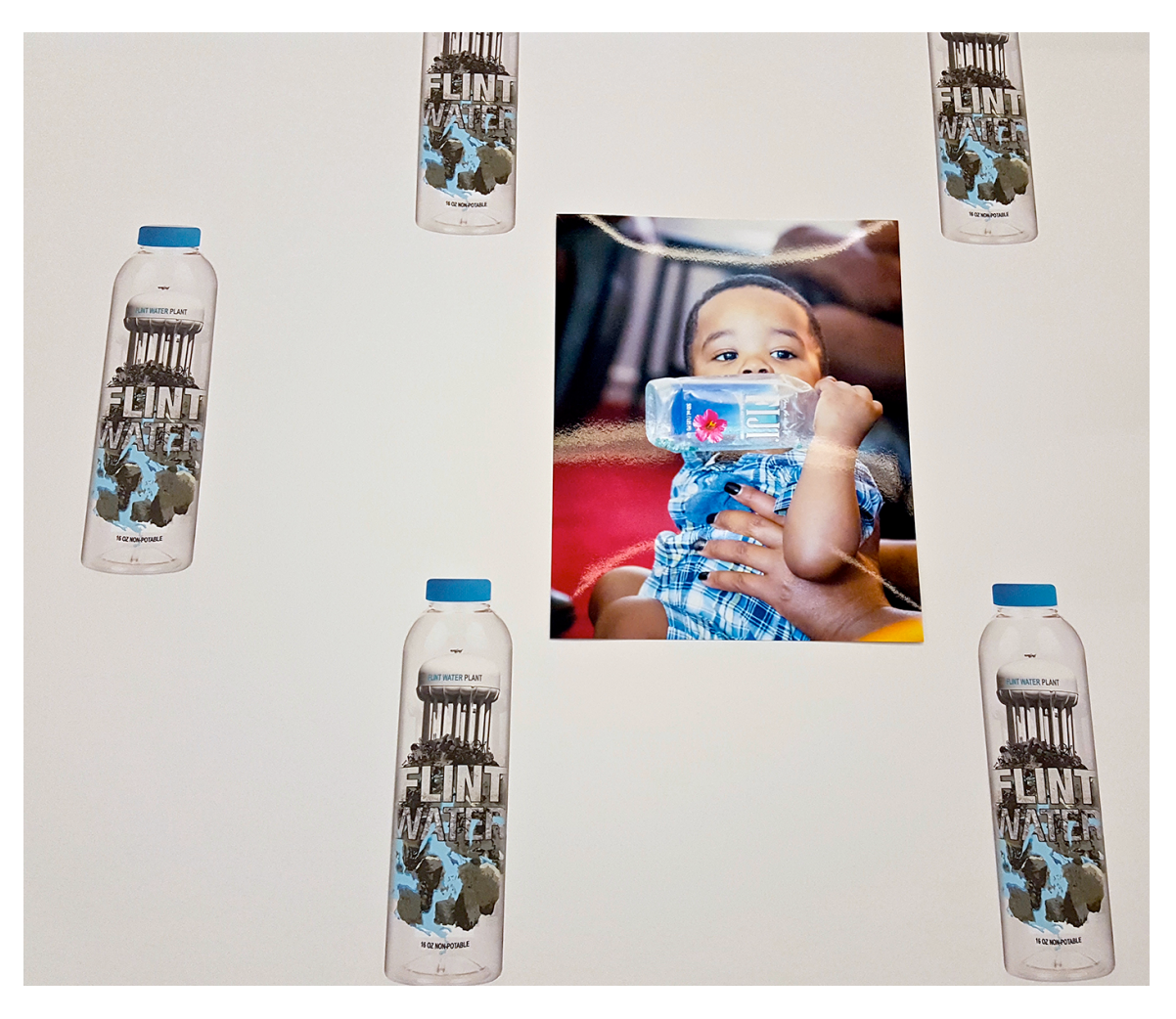
of one the young resident of Flint affected by the contamination of the city's water supply, part of Pope.L's Flint Water Project at What Pipeline