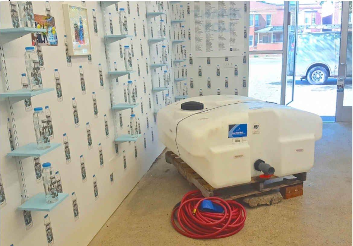
Installation view, "Flint Water Project" at What Pipeline

"When he came to visit, we actually took him to Cass Cafe [a longtime Detroit eatery that features a rotating program of local artists in its dining room], and he's looking around and thought we should hang some art by local artists in the space, to soften the edges of the show,"