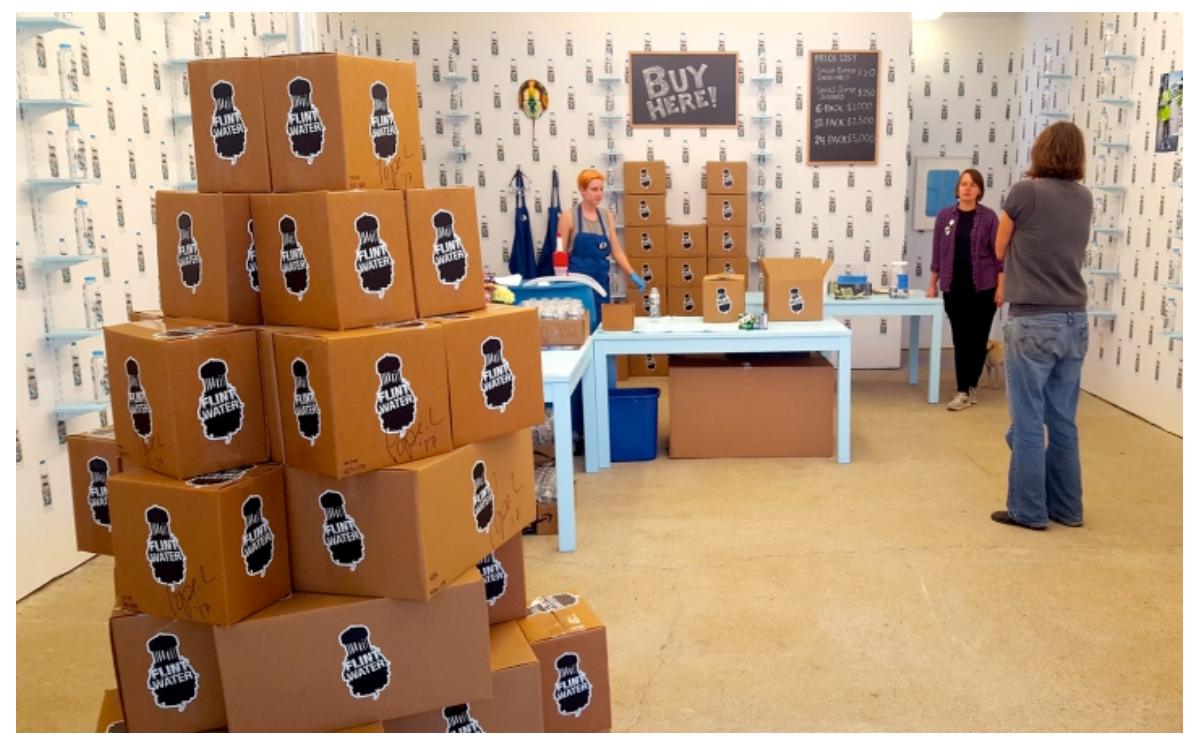
Installation view, Flint Water Project at What Pipeline