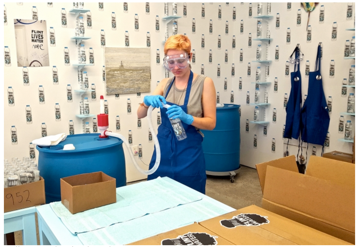
Gallery attendant bottling Flint water

said Alivia Zivich. Hanging art over an art installation reinforces the aesthetic of the Water Shop as a capitalist boutique. The shop also hosts a kind of informal performance art work, as a shop attendant in safety goggles and gloves begins siphoning Flint water into branded bottles for sale as soon as visitors enter the gallery. As with the rest of the exhibit — and indeed, the greater situation in Flint — the line between performance and necessary safety precautions is unclear.