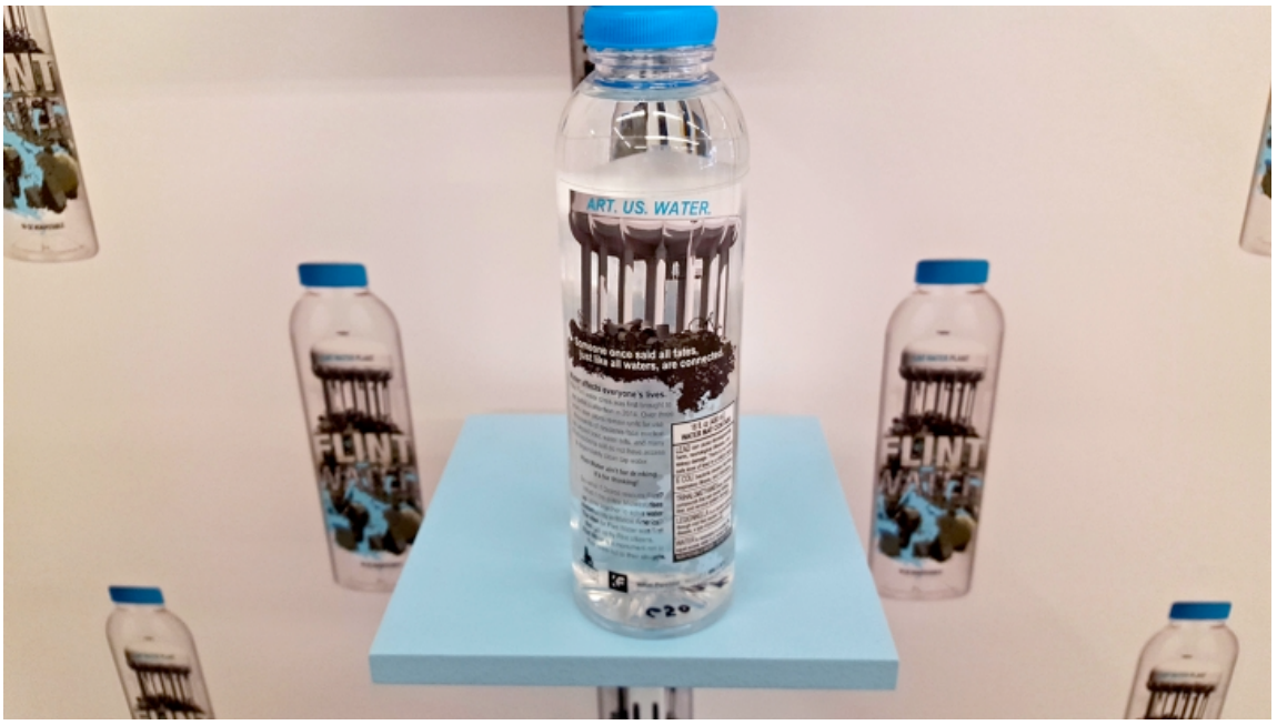
Installation view, Flint Water Project at What Pipeline

source from Lake Huron to the Flint River. The pH of this new water interacted toxically with Flint's aging infrastructure, resulting in the mass lead-poisoning of a large cross-section of an <u>already embattled citizenry</u>. Despite numerous complaints raised by consumers immediately following the switch, Flint city authorities continued to reassure residents that the water was safe to drink well into the following year, when it came to light that in fact the water contained lead levels that were, in some cases, dozens or hundreds of times higher than the Environmental Protection Agency's safety threshold. Flint officials have also been implicated in <u>fatal</u> outbreaks of Legionnaires' disease due to the contaminated water.