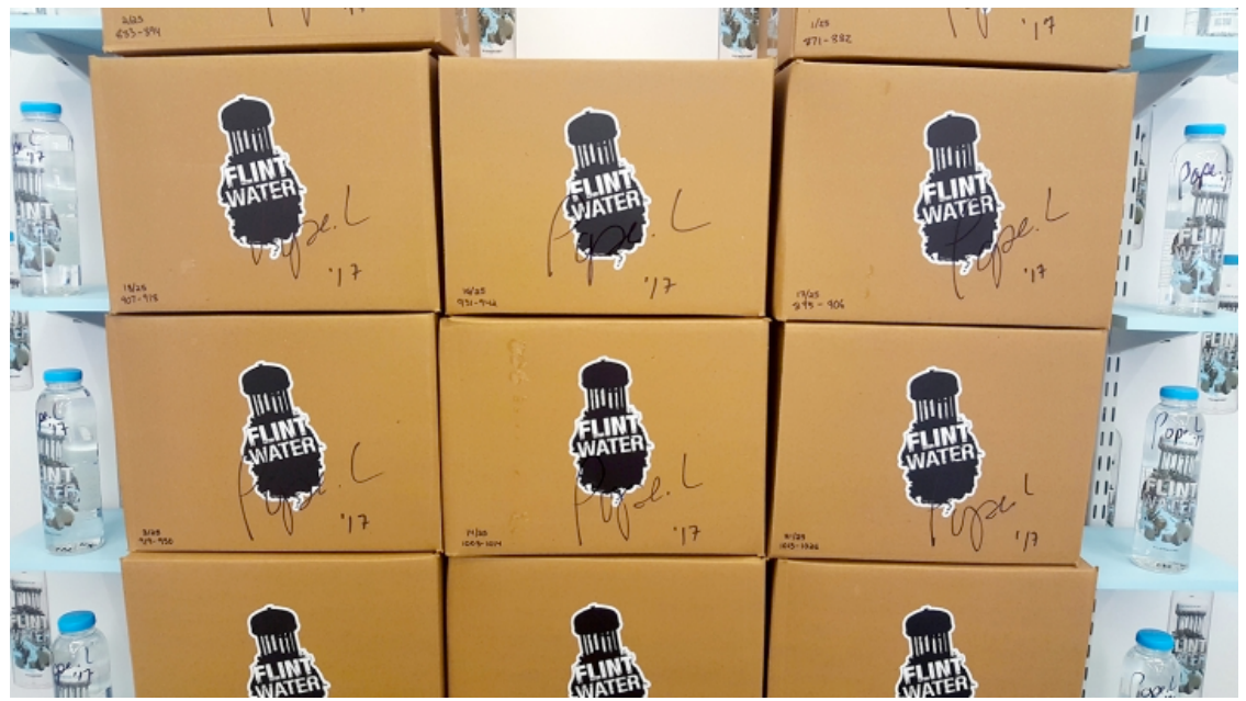
"Flint Water Project" at What Pipeline, installation view.

The logistical concerns for the gallery merely underscore the ongoing concerns of Flint residents, in their struggle for access to water they can trust. Pope.L has seized upon some contradictory facts during his research: "Now the EPA says the water is safe, but says citizens must continue to filter their water," he said. "So is it safe?" While normally the open-ended questions raised by art are part of its appeal, they become incredibly sinister when it comes down to matters of public safety. Pope.L and What Pipeline are to be commended for their heady practice and their efforts to use art to maintain focus on the struggle for life's basic necessities.