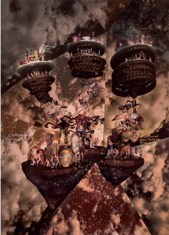
Jacolby Satterwhite, En Plein Air: Abduction III , 2014, digital C-print, 84 × 60".