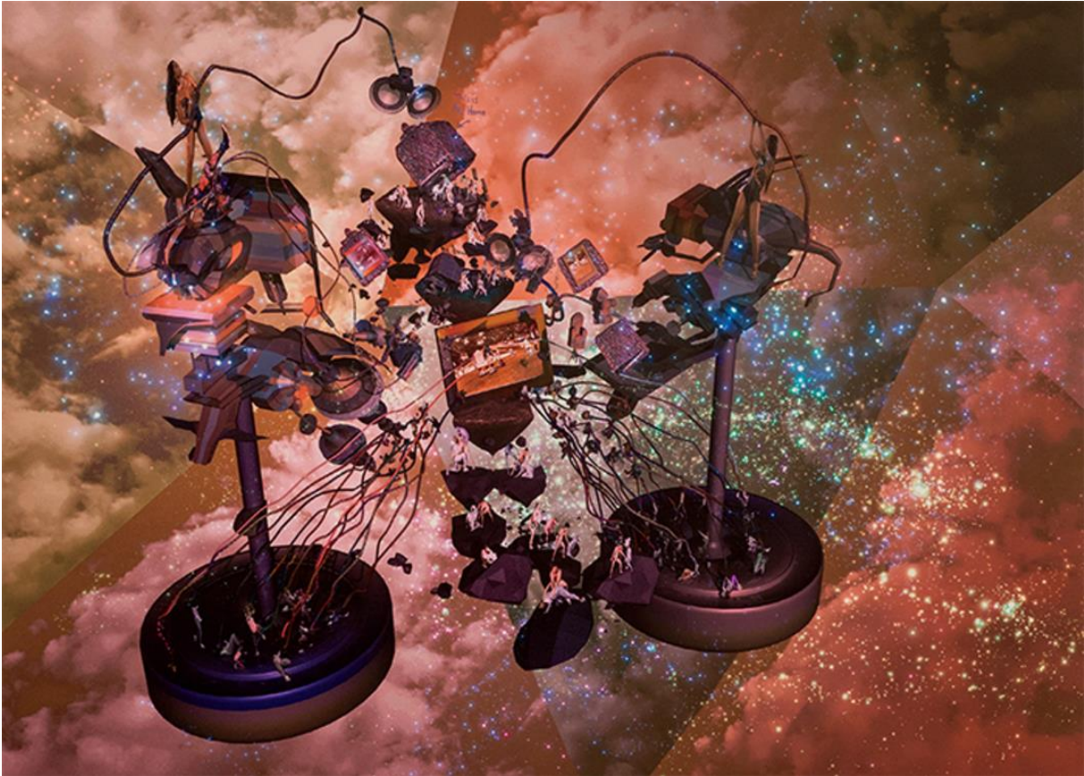
Jacolby Satterwhite, En Plein Air: Vassalage II , 2014, digital C-print, 60 × 84".