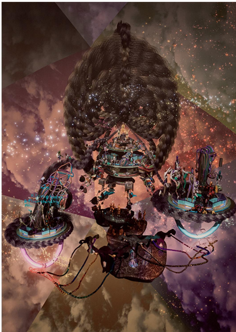
Jacolby Satterwhite, En Plein Air: Abduction II , 2014, digital C-print, 84 × 60".

TRINA, THE RAPPER FROM MIAMI , is also known as the Diamond Princess, and her crystalline image is everywhere, from the fan site Oh-Trina.com to bottles of her namesake perfume. She is everywhere, in particular, in Jacolby Satterwhite's new series of tableaux, "En Plein Air." Endless iterations of her pneumatic figure populate galactic landscapes in glittery jewel tones, surrounded by renderings of other contorted, slickly muscled bodies—including that of Satterwhite himself. The bodies perch and sway on