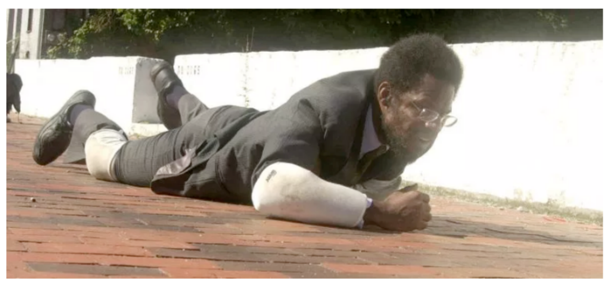
Pope.L performing a crawl in 2002.