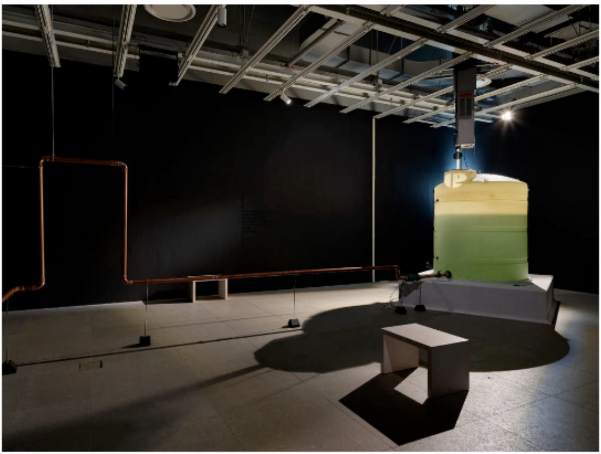
Pope.L's new immersive sound and sculptural installation, "Choir," at the Whitney Museum of American Art.

In September 2019, the Public Art Fund mounted a big group "crawl," echoing the ones Pope.L has performed throughout his career. Called "Conquest," it involved more than 140 volunteers crawling through the city, from a playground in Greenwich Village to Union Square. The main event is at MoMA, though, where you can experience the arc of the artist's performance career.