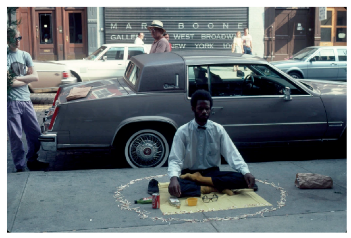
"Thunderbird Immolation a.k.a Meditation Square Piece," New York, 1978.

that subscribing to The Journal would enrich the recipient, so he decided to lampoon the paper's magical power by consuming it.