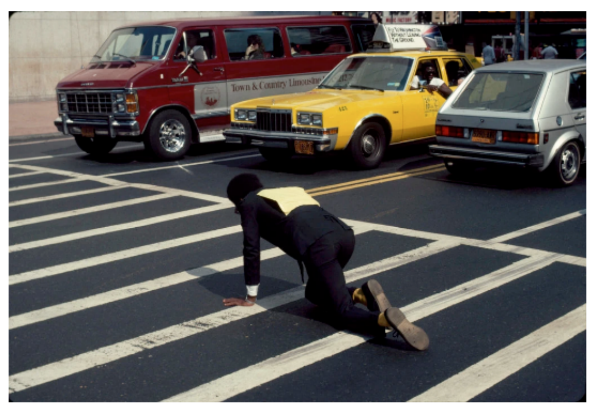
Pope. L's "Times Square Crawl a.k.a Meditation Square Piece," from 1978.

crawling, ingesting and meditating are couched in earlier actions and overlaid with social critique.