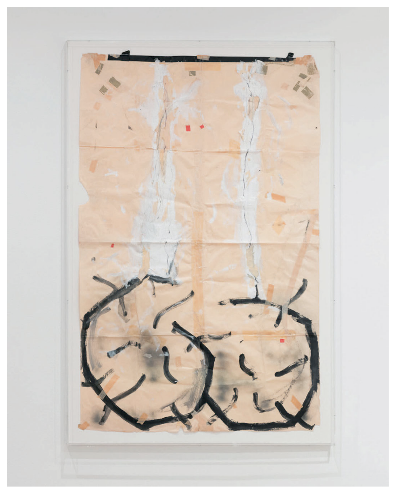
Pope.L, Egg Eating Contest (Basement version) , 1990, acrylic, pressure-sensitive tape, spray paint, and ballpoint pen on paper, 65 1/2 \times 42 ". © Pope.L.

Cutting in all directions, the monologue inflates tropes of black cultural nationalism until they become vulgar, silly, and impotent. The video concludes when the protagonist is electrocuted by his white assistant, although this was not the end of the performance. These works in the screening room are the only extant recordings of much of Pope.L's early theater work, and nearly all of them conclude this way—that is, abruptly, often cutting out mid-sentence. Also in this room, an artwork— Package Received but Never Opened #21, 2017, a gift basket wrapped in clear cellophane—is tucked away behind the screen and illuminated by a dramatic red light. A second work of mail art, Package Received but Never Opened #167, 2015, a parcel wrapped in brown paper, is installed high on a platform in a corner. Notably, along with the Failure Drawings on scrap paper scattered throughout the galleries, these fall outside the exhibition's chronological scope; they are among its only "autonomous" works, pieces of art in their own right, distinct from the stage props, costumes, ephemera, and other relics of live performances that constitute the majority of objects