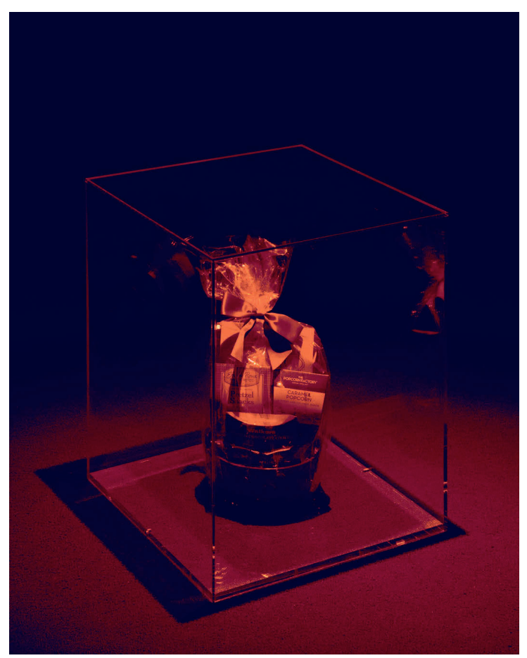
Pope.L, Package Received but Never Opened # 21 , 2017, Maisie's Savory snack mix, The Popcorn Factory caramel popcorn, Emilie Roux Pretzel snacks, Walker's Belgian chocolate cookies, Ghirardelli dark chocolate blueberry squares, ceramic bowl, clear plastic, silk ribbon. Installation view, Museum of Modern Art, New York, 2019. Photo: Chandra Glick. © Pope.L.

in the show. Foregrounding their status as mute, satirically self-contained sculptures, they throw into relief the difficulty of critically engaging with the videos, which are replete with moral provocations that cannot be adjudicated on the basis of these excerpts, none more than a few minutes long. To get ahold of the internal dynamics of these performances, we would need access to their full narrative arcs, some window into the totality of their abrasive propositions.