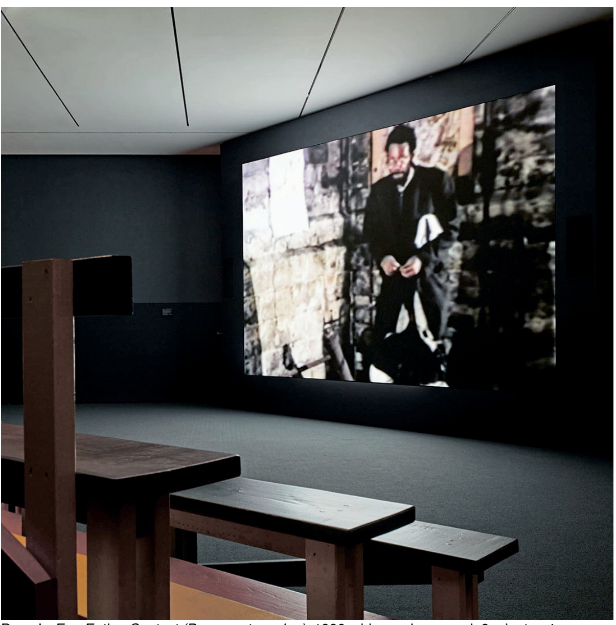
Pope.L, Egg Eating Contest (Basement version), 1990, video, color, sound, 8 minutes 4 seconds. Installation view, Museum of Modern Art, New York, 2019. © Pope.L.