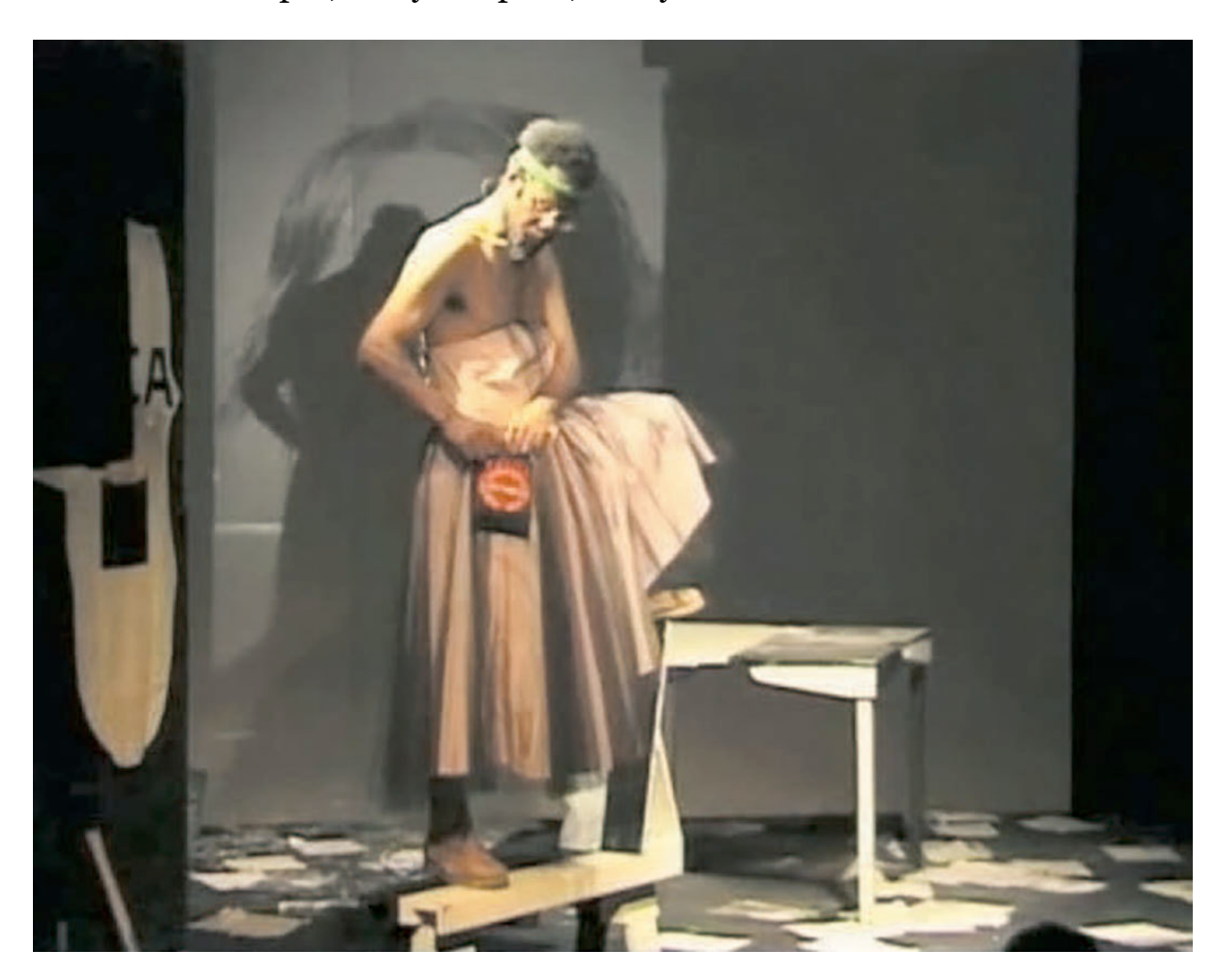
Still from Pope.L's Eracism (version 8b) , 2000, video, color, sound, 10 minutes 24 seconds. © Pope.L.

2004–2006—a project in which he and a team of assistants traveled around the United States in a delivery truck asking people to donate objects that represent blackness—as a work of theater. In his early days, he says, he would have called the idea "too-too-too fancy pants!," preferring instead "a floppy, goofy, stupid proscenium." A collection of the donated objects is installed in a hallway, marking a transition from experimental theater to full-fledged contemporary performance art—"the white biz," as he calls it in Aunt Jenny . He attributes his arm's-length relation to both "Theater" and "Art" to the influence of his grad-school adviser, Fluxus artist Geoffrey Hendricks, from whom he adopted the general attitude of that movement: "learned but stupid, fancy but poor, funny but sad."