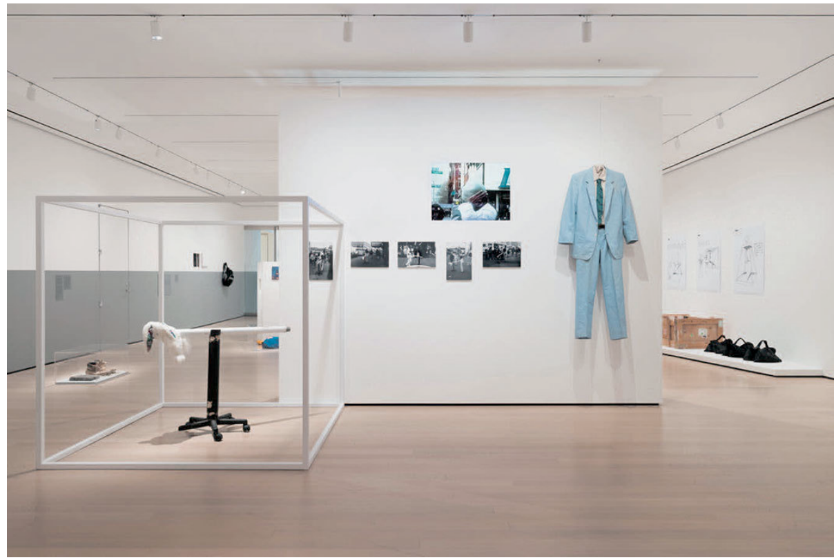
View of "member: Pope.L, 1978–2001," 2019–20, Museum of Modern Art, New York. Center: Member a.k.a. Schlong Journey, 1996. © Pope.L.