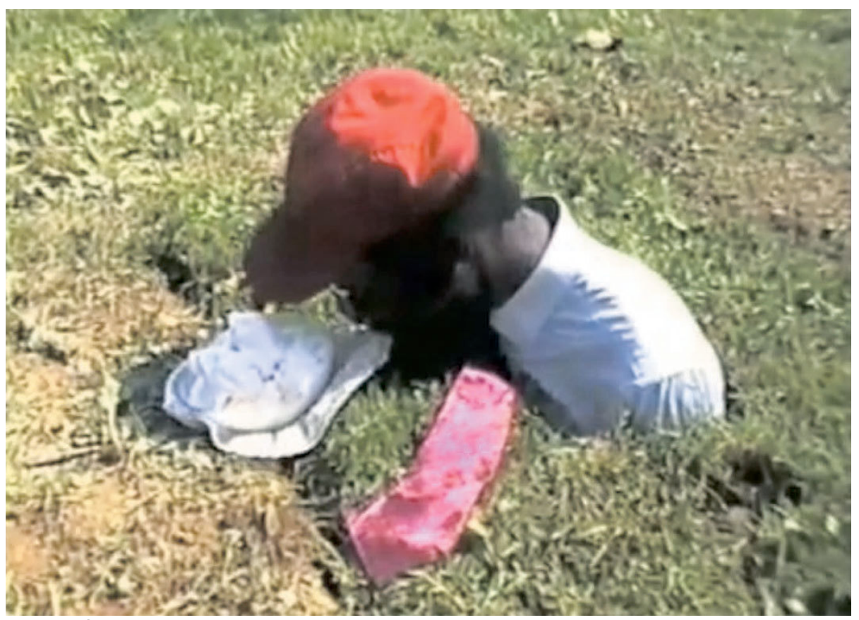
Pope.L, Sweet Desire a.k.a. Burial Piece, 1996, video, color, sound, 4 minutes 19 seconds. © Pope.L.

Beyond taking aim at the usual suspects (white liberal philanthropy, bluechip galleries, racial essentialism, black bourgeois respectability, "patriarchy in general"), Pope.L deploys his anarchic approach in lacerating self-examination. He suspects his own motives and questions the sincerity of his critique. A poem published in Performance Journal in 1991, partially reproduced in the show, concerns the suspicion that his street performances—particularly the famous crawls, in which he pulls himself, at great harm to his body, through the gutters of New York—are ultimately self-serving and amount only to his "pretending to suffer." But his guilt about having a "good job in bad times" passes over into something careless. "Cashing my paycheck over the bodies in Palestine / See 'em laid out like Jewry on the Bowery." The middle term, "Jewry," is absent from the version of the text reproduced on a gallery wall as a disordered facsimile reproduction of his 1992 artist book William Pope.L's "How Much Is that Nigger in the Window": Rap Street Journal, the pages of which are heavily redacted for poetic effect. But the discrepancy between the published and unreproduced versions raises an issue that goes to the heart of the show what are the ends of profanation and provocation? Why the accented homophony here—the riff on jewelry and Jews? Why risk a conflation—