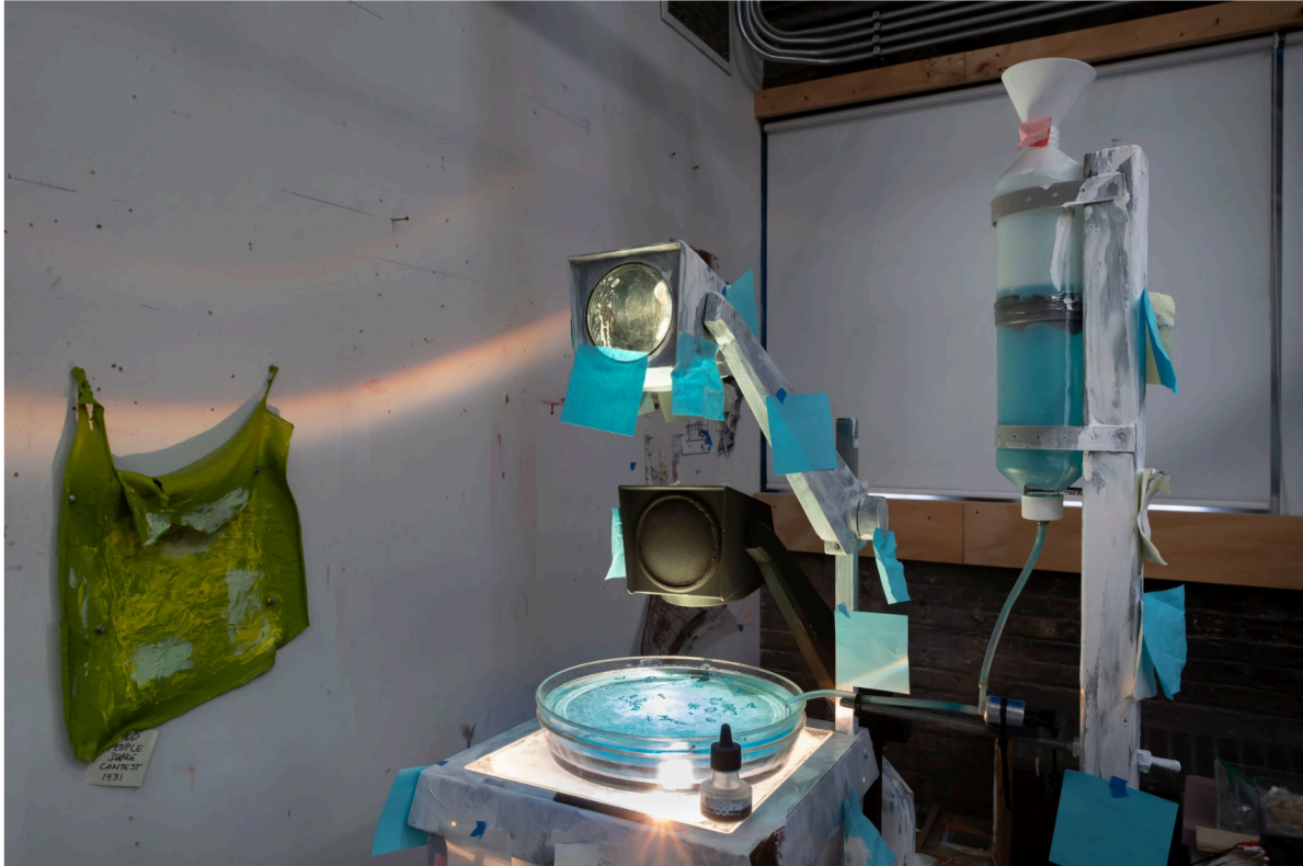
An alternate view of "I Machine."

Can you describe what's going on in it? This work is about our need for self-blinding and encourages reflection on our use, as a community, of unknowledge, misinformation and ignorance. The recent controversy regarding The New York Times allowing the printing of a hot topic Op-Ed by Senator Tom Cotton without proper vetting is a layered example. Who, in this scenario, is the most ignorant actor? The Cotton? NYT? Or us? Is it the Senator, because he recommends killing his own? Is it the "Tombs," because they condoned his ignorance and then claimed they did not know what they were publishing? Or is it Us'n, myself included, because, well, it's The Times, and they stand for us all? Well. Maybe they do not. Maybe they cannot. Maybe they have not. For a while now. And we, and we were too self-blinding to admit it?