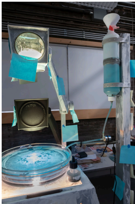
Another detail of the artwork.