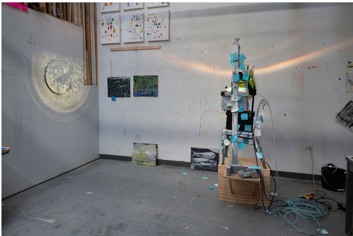
Pope.L's "I Machine" (2014-20).

Pope.L, known for exploring themes of endurance alongside the history of race in America, shares a recent piece.