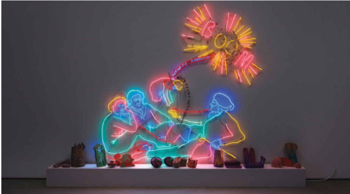
Jacolby Satterwhite, Black Luncheon , 2020, animated neon, 84 × 88".