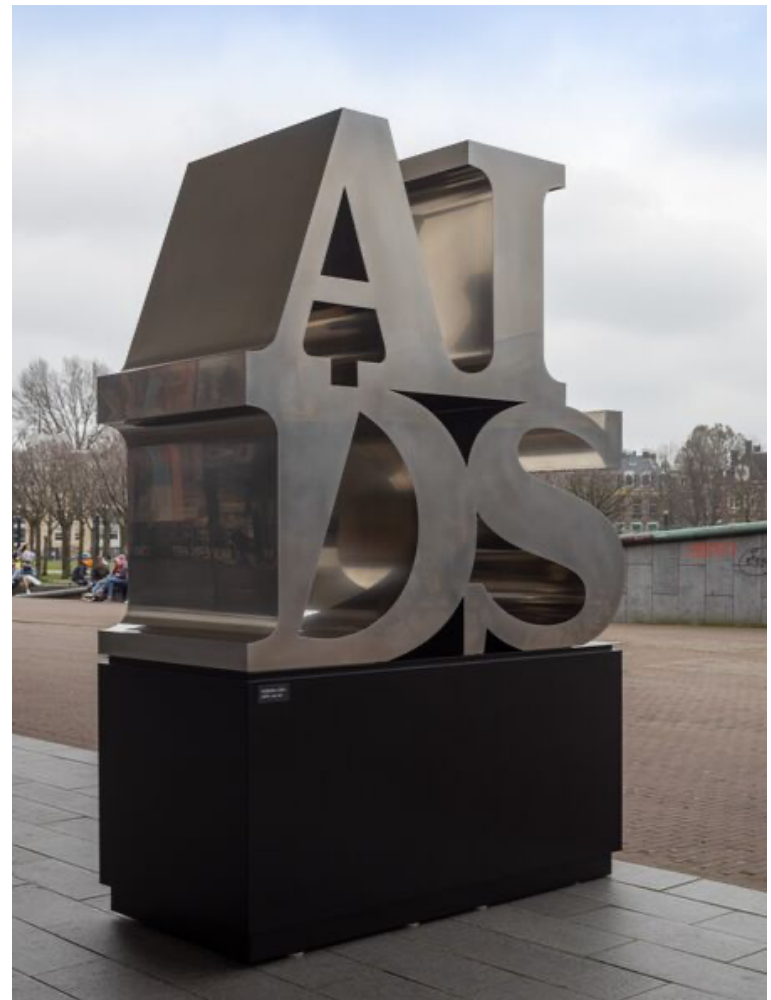
General Idea, installation view of AIDS Sculpture, 1989/2021, in "General Idea" at the Stedelijk Museum, 2023. © General Idea. Photo by Peter Tijhuis. Courtesy of the Stedelijk Museum.

Today, of course, these works take on another tone. More than 40 years into the ongoing HIV epidemic, their function is not just to raise awareness, but to remember the vast number of lives lost to AIDS over decades. At the Stedelijk, a huge sculpture of the disease's four block letters sits outside the museum, which immediately turned into a canvas for museum visitors: "It became a memorial—people are writing names," said Bronson. As well as a provocation, this bold public sculpture represents General Idea's inclusive attitude to viewers: "The work is only successful if the work reaches out to the audience and involves [them]."