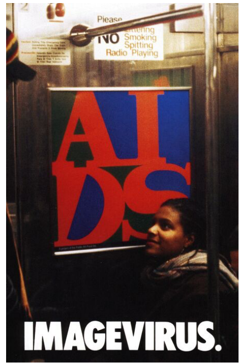
General Idea, Imagevirus (New York Subway), 1991. "General Idea: Broken Time" at Museo Jumex, Mexico City

In the show, General Idea's prankish takes on the media take center stage, like in the 1985 work Shut The Fuck Up, a faux television show about famous artists that turns art world clichés into farce. By repurposing the strategies of contemporary media into humorous barbs, the group critiqued the formats of mass media—its lack of nuance, flattening churn, and constant thirst for attention. In 2023, it's clear that social media has only exacerbated these tendencies.