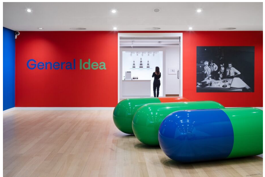
General Idea, installation view of Green (Permanent) PLA©EBO, 1991, in "General Idea" at the Stedelijk Museum, 2023. © General Idea.

Amsterdam was always an important location for the group, and the Stedelijk Museum was where they had their first institutional show in 1979. "It became our European home," said Bronson, who is now based in Berlin. The artist is pleased with the way the retrospective (which was also shown at the National Gallery of Canada last year, and will continue to Berlin's Gropius Bau in the fall) has been laid out with works arranged thematically, rather than chronologically. "I find that really refreshing: It feels new and not like something out of a textbook," he said.