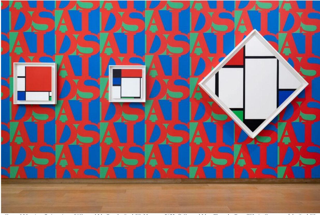
General Idea, installation view of "General Idea" at the Stedelijk Museum, 2023. © General Idea. Photo by Peter Tijhuis. Courtesy of the Stedelijk Museum.

General Idea applied this critical mindset equally to the art world. In Gold Diggers of '84 (1972), for instance, the trio mailed postcards to MoMA, the Louvre, and the National Gallery of Canada. Half–elaborate performance piece, half–practical joke, the cards' messages stated that they were artworks—a way to cheekily suggest General Idea was collected by those institutions. They also frequently referenced the characteristic imagery of other artists in their work: Yves Klein's infamous use of a specific blue becomes a farcical talking point in Shut The Fuck Up, for instance.