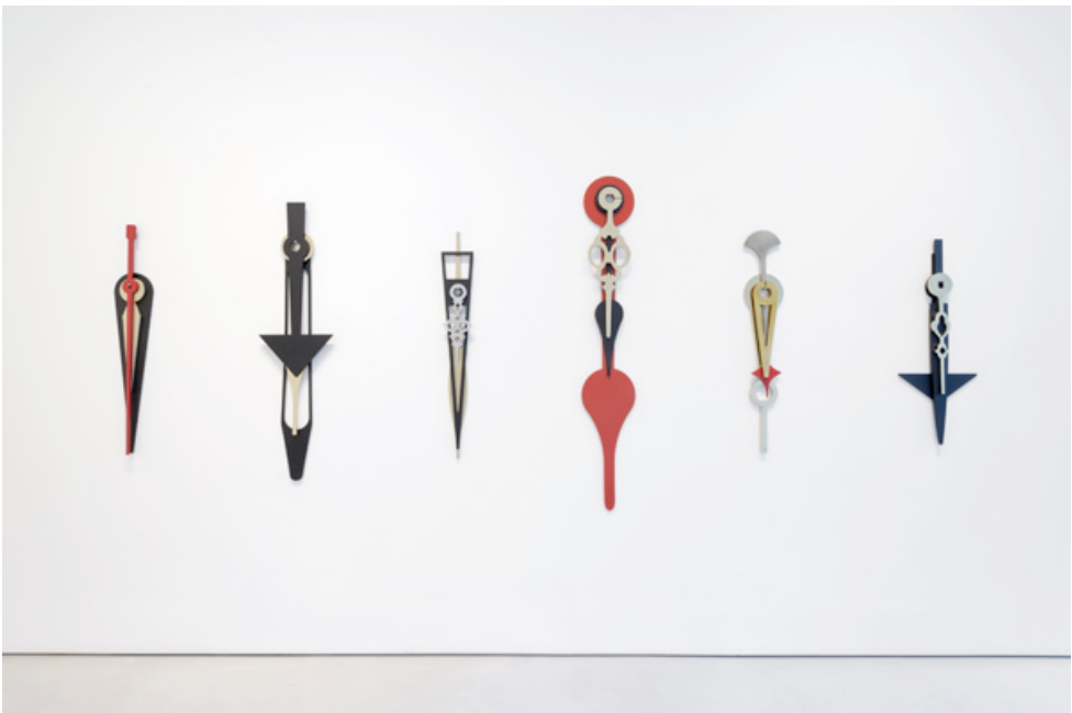
Installation view of My Pen is Huge at Mitchell-Innes & Nash, NY, 2017