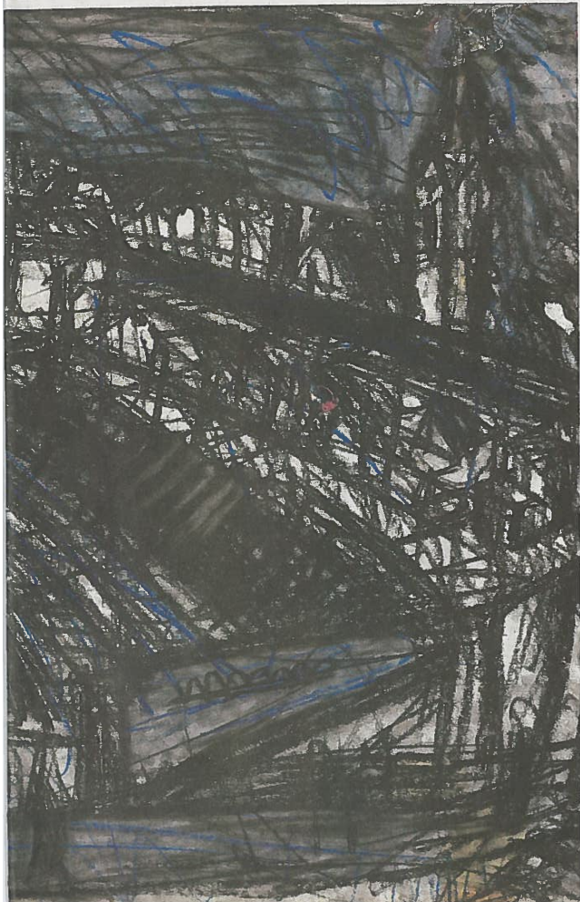
Life going on ... Leon Kossoff (below left) with (main picture) Dalston Lane No 1 (1974) and Midland Hotel Staircase

final image would emerge only after many months of applying and then scraping away paint.