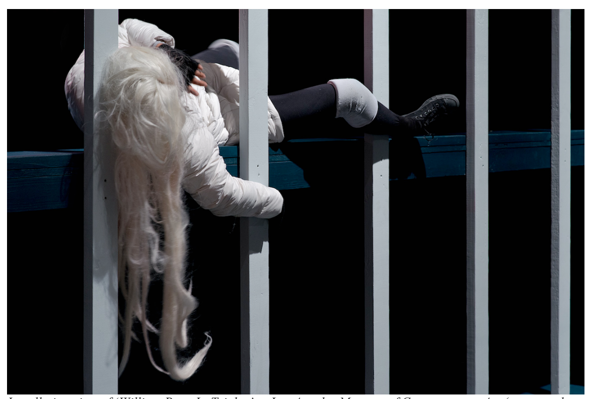
Installation view of 'William Pope.L: Trinket' at Los Angeles Museum of Contemporary Art

Samuel Jablon: What I find really interesting about your work is your ability to move between mediums. Could you talk about how you choose which medium is best?