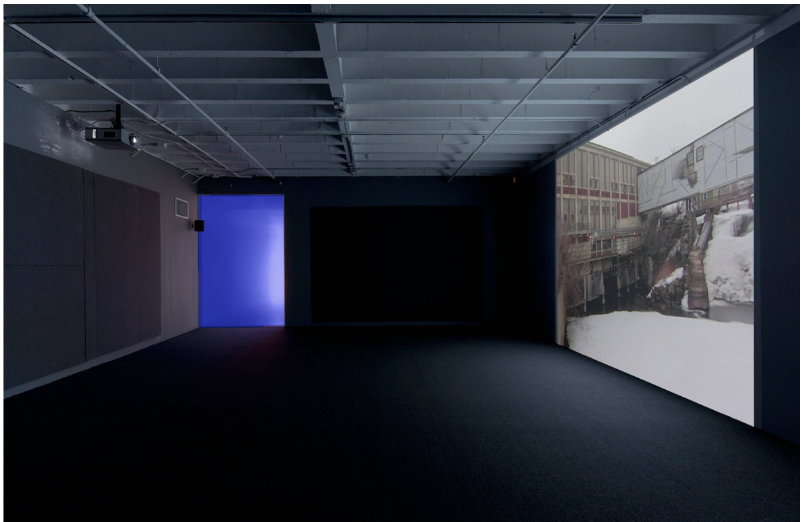
Installation view of 'William Pope.L: Trinket' at Los Angeles Museum of Contemporary Art

SJ: Your work is like an alarm clock going off without a snooze button. Do you believe art has the ability to create enough of a discourse to change the status quo?