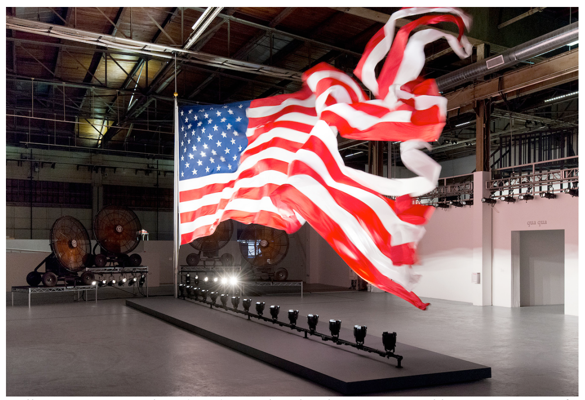
William Pope.L, "Trinket" (2008), mixed media, dimensions variable, approx. 38 x 16 ft (all images courtesy Los Angeles Museum of Contemporary Art 2015 and the artist \bigcirc Pope.L)

William Pope.L on "Acting a Fool" and Alternative Futures by Samuel Jablon July 10, 2015