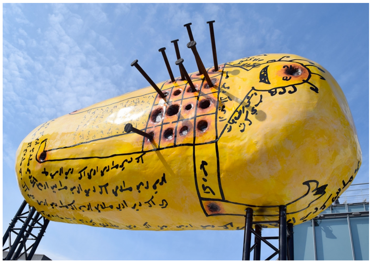
GCC, "Local police find fruit with spells" (2017)