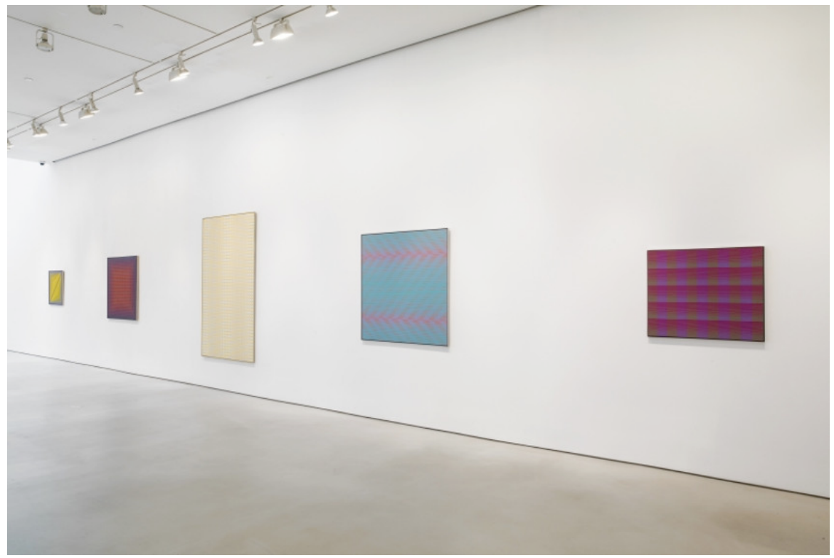
Julian Stanczak - The Life of the Surface, Paintings 1970 – 1975, installation view at Mitchell-Innes and Nash NY, 2017