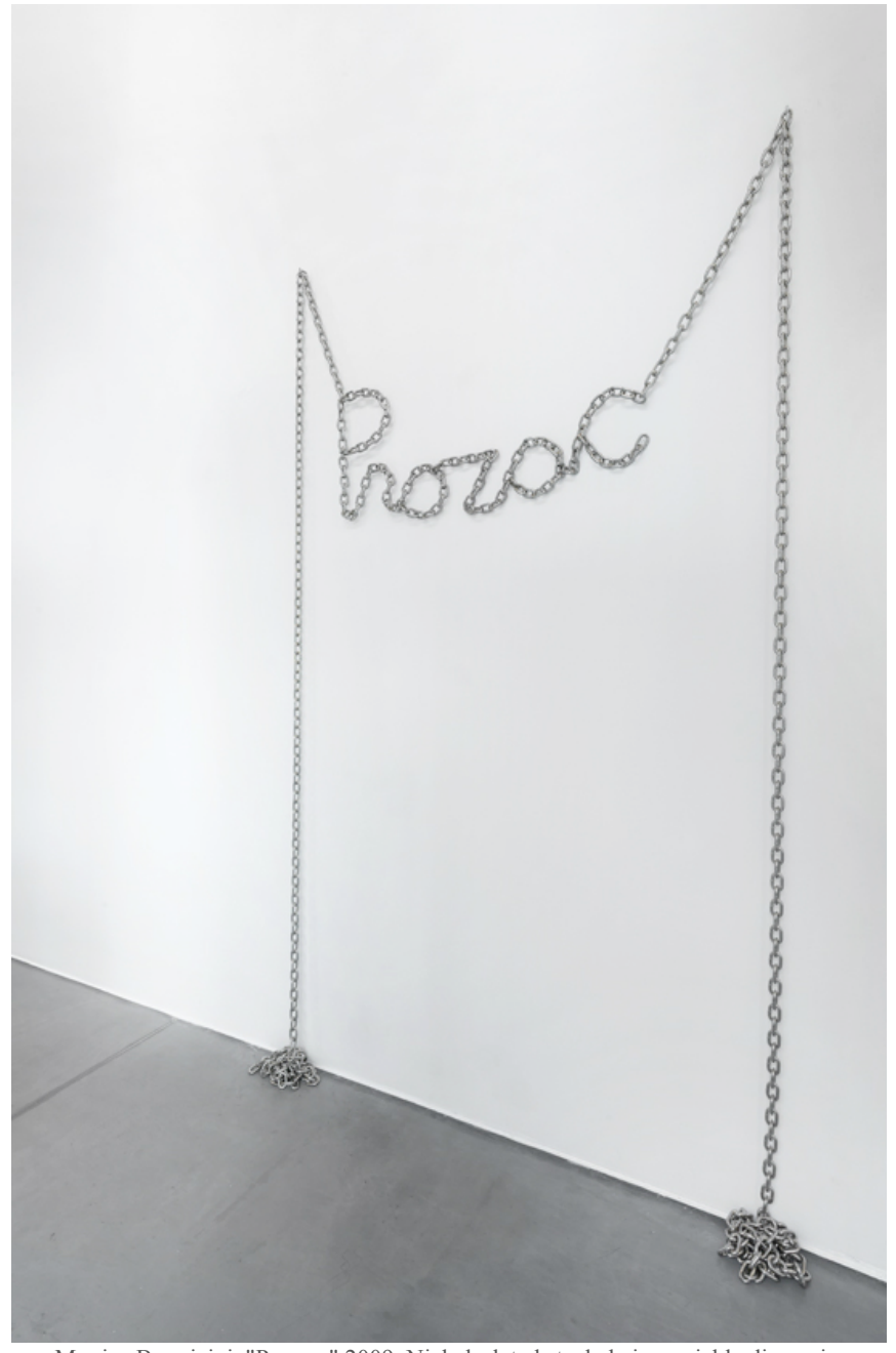
Monica Bonvicini, "Prozac," 2009. Nickel-plated steel chain, variable dimensions.