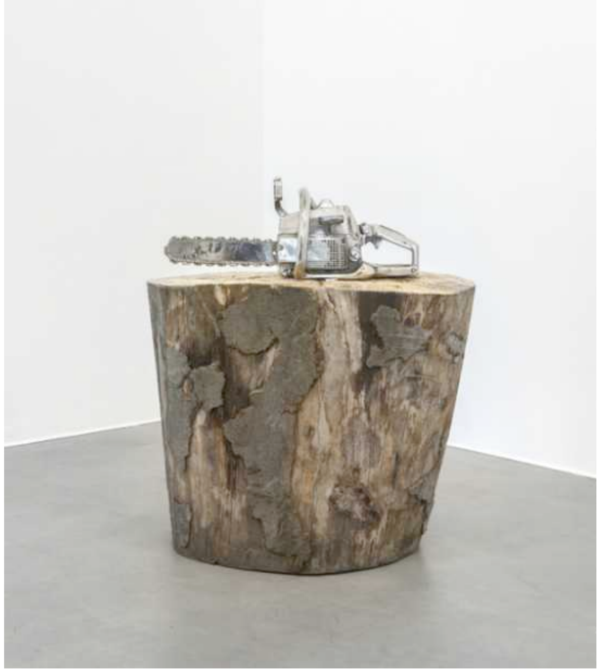
Monica Bonvicini, "Chainsaw chromed," 2012. Nickel plated chainsaw, 71.5 x 27.5 x 25 cm. Unique.