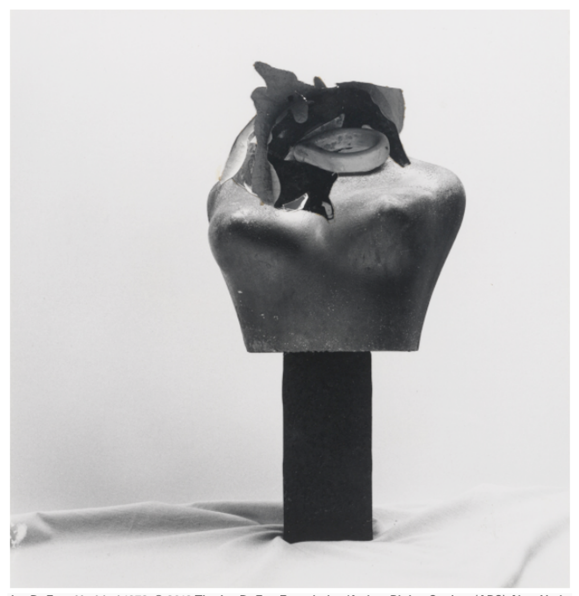
Jay DeFeo, Untitled, 1973. © 2018 The Jay DeFeo Foundation/Artists Rights Society (ARS), New York.