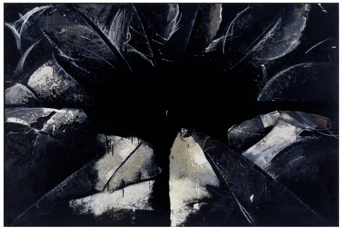
Jay DeFeo, Cabbage Rose, 1975. © 2018 The Jay DeFeo Foundation/Artists Rights Society (ARS), New York.

"The Ripple Effect," which will travel to the <u>Aspen Art Museum</u> in June after Dijon, is built around four groupings of works based on a looped handle broken off a coffee cup, the leaves of a cabbage plant, a collection of used erasers that DeFeo kneaded into sculptural forms, and a draped tripod that assumes animate characteristics. From each of these models, "DeFeo did works back and forth across media, across scale," says Levy of these acrylics, photographs, collages, and drawings. "She looked at things from all angles."