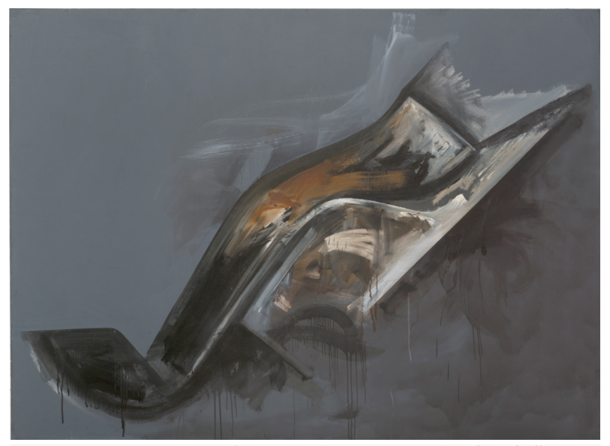
Jay DeFeo, Untitled (Reclining Figure), 1986.

take on the dimensions of an otherworldly landscape. Just as DeFeo had cut up images from girlie magazines in the 1950s to make pinwheel collages, the artist now played with cutting up her own photographs, responding to a suggestion that Conner had made in 1973. These photo-collages, such as one of an old-fashioned candlestick telephone with a light bulb in place of its receiver, suggest anthropomorphic creatures.