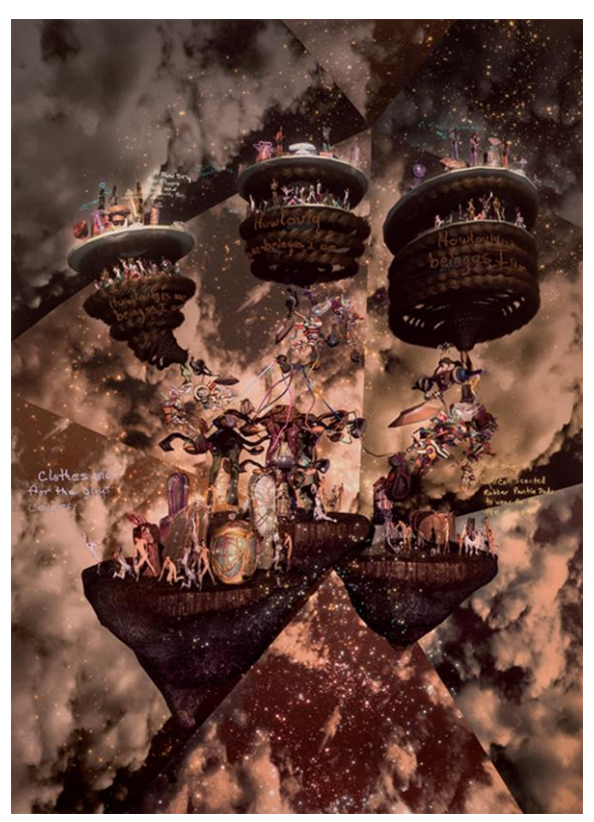
Jacolby Satterwhite, En Plein Air: Abduction III , 2014 , digital C-print, 84 \times 60 ".