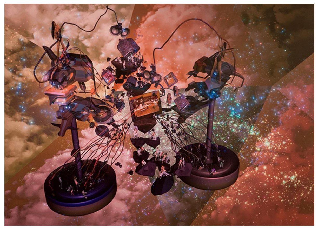
Jacolby Satterwhite, En Plein Air: Vassalage II, 2014, digital C-print, 60 × 84".