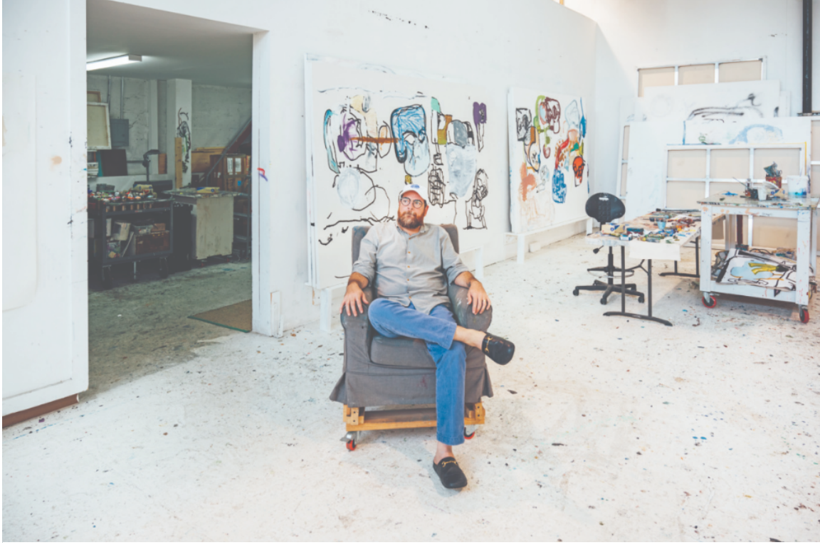
BROOKLYN-BASED PAINTER EDDIE MARTINEZ'S WINDING PATH HAS LANDED HIM AT THE EPICENTER OF CONTEMPORARY ABSTRACTION.

1018 MADISON AVENUE NEW YORK 10075 | 534 WEST 26TH STREET NEW YORK 10001 212 744 7400 WWW.MIANDN.COM