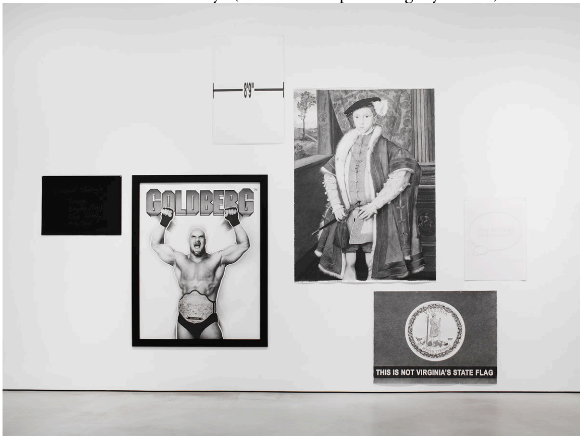
Installation view of Karl Haendel, "Mass & Mainstream," at Mitchell-Innes & Nash, New York, 2019. © Karl Haendel. Courtesy of the artist and Mitchell-Innes & Nash, New York.

But a very different attitude prevails in a show of recent drawings by Karl Haendel , on view through February 16th at Mitchell-Innes & Nash in New York. Walking into the inventively installed exhibition is like entering the artist's own brain, populated by fleeting images, obsessions, and anxieties. A hyperrealistic rendering of the professional wrestler Goldberg is hung next to Child King 3 (2018), an elegant pencil portrait appropriated from a 16th-century source. These moments of bravado, though, are undercut by nagging doubts that punctuate the show. One drawing, with its casually scrawled handwriting, summarizes the artist's desires: "Taller / Bigger Penis / More Money / More Time." Another simply depicts a thought bubble that asks: "How do I make more money? (*without compromising my morals)."