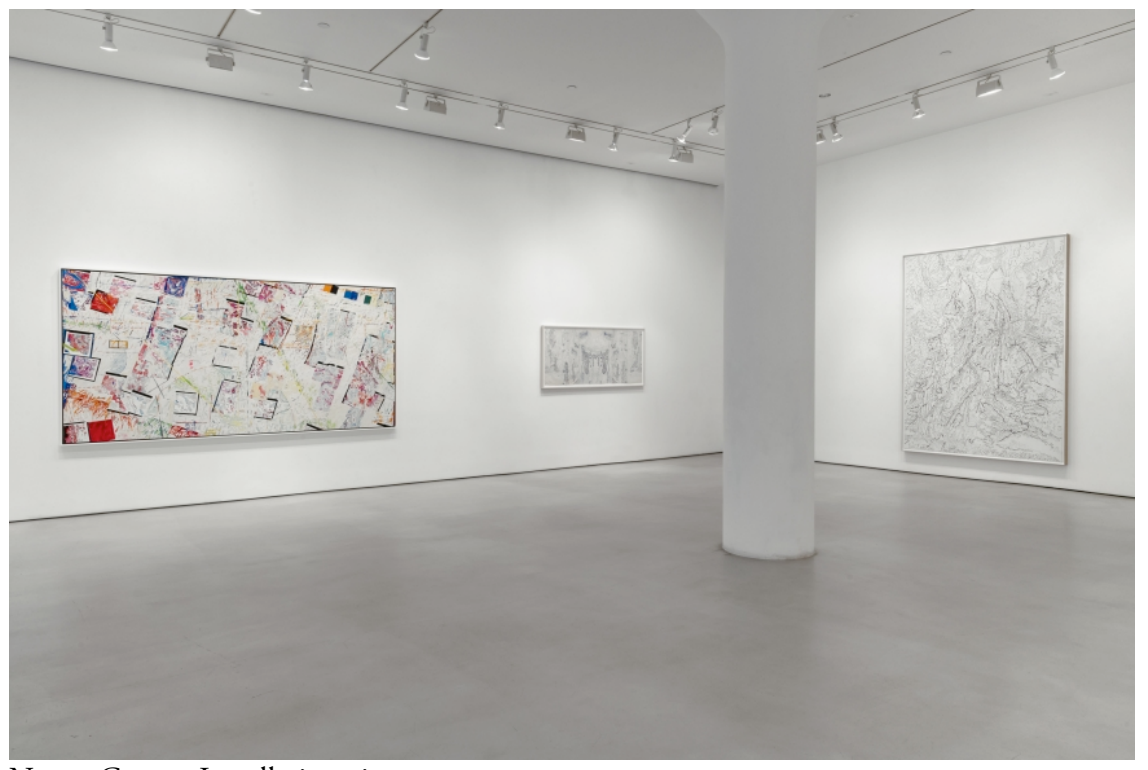
Nancy Graves, Installation view

Around the corner hangs Indian Ocean Floor II (1972), a towering painting in black and white. This piece and its companion (not on view) are based on