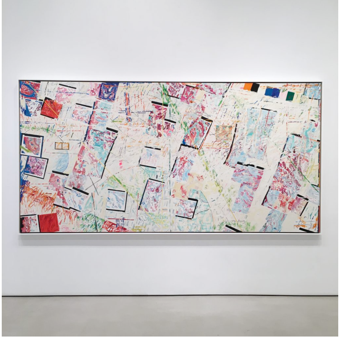
Nancy Graves, Untitled #7 (1976), oil on canvas, 64 x 128 inches.

impart the transmission of some unknown data; as the eye rockets from one dot to the next, hidden images and vibrating patterns emerge.