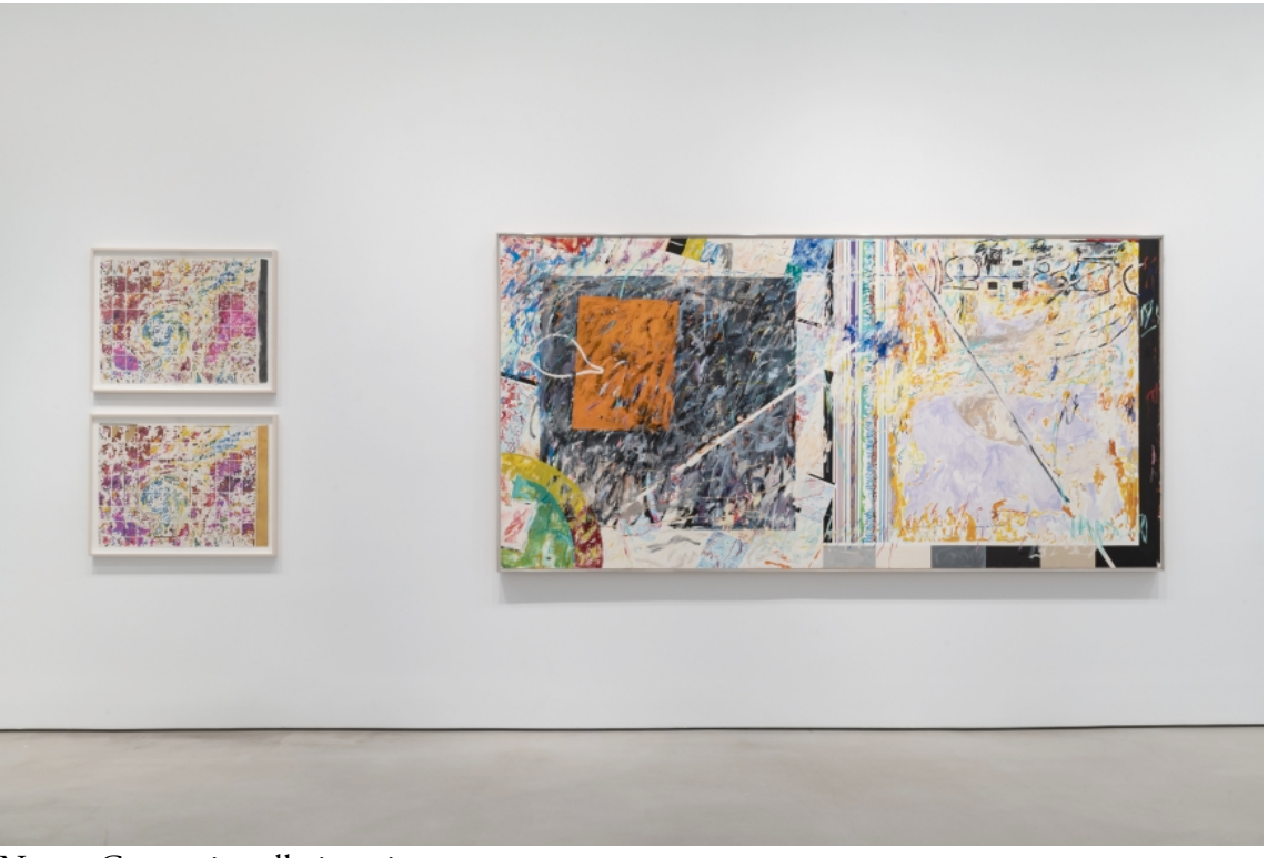
Nancy Graves, installation view

Hanging close by is Apollo 14 (1973), a grey-tone horizontal-jutzy work of graphite and gouache on paper. It's Graves' interpretation of NASA's eighth manned mission to the moon, rendering still the televised moment when starman Alan Shepard took a golf swing on its surface.