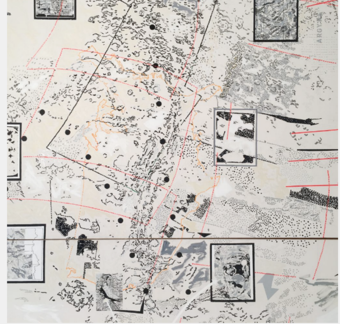
Nancy Graves, Mars (1973), detail, acrylic on canvas, 4 panels, overall: 96 x 288 inches.

March 30, 2019 Nancy Graves: Sorting the cosmic haze 4:04 pm by Editor