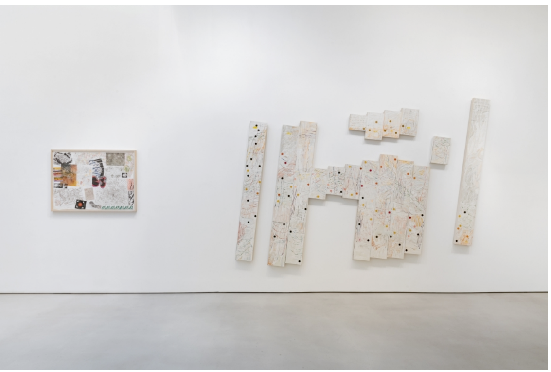
Nancy Graves, installation view