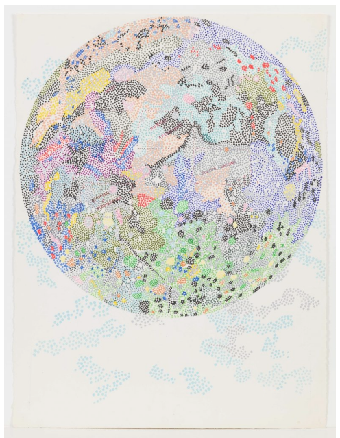
Nancy Graves, Untitled #127 (Drawing of the Moon)(c. 1972z0, Watercolor, gouache and pencil on paper, 30 \times 22 \times 1/2 inches

sculpture a rest and focused on interpreting scientific developments in the intrepid work now on view in Chelsea.