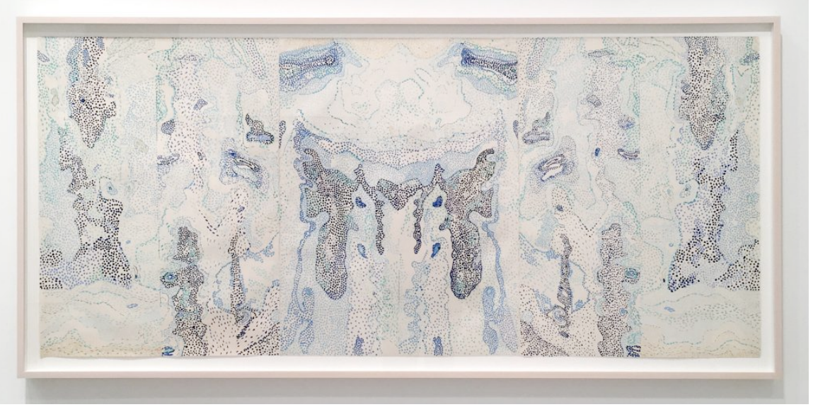
Nancy Graves, Untitled #97 (Blue Map Triptych), 1972, Gouache, acrylic and pencil on paper, three sheets, overall: 30 x 67 ½ inches

Among the many meticulous works on paper is a cosmic Untitled #97 (Blue Map Triptych) (1972). Blue dots jive with off-grey ones to form what looks like a Rorschach test. The work's trippy symmetry brings to question the very psychology of "looking." Are we analyzing a drawing or is it analyzing us?