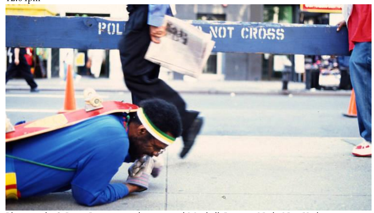
Photograph: © Pope. L., courtesy the artist and Mitchell-Innes & Nash, New York

By Howard Halle Posted: Friday September 20 2019, 12:04pm