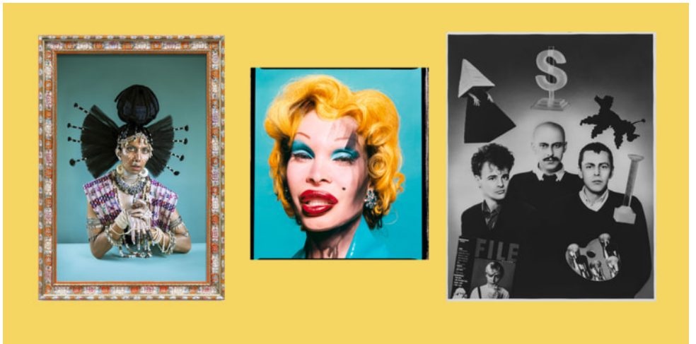
Art by Martine Gutierrez, David LaChapelle and General Idea.