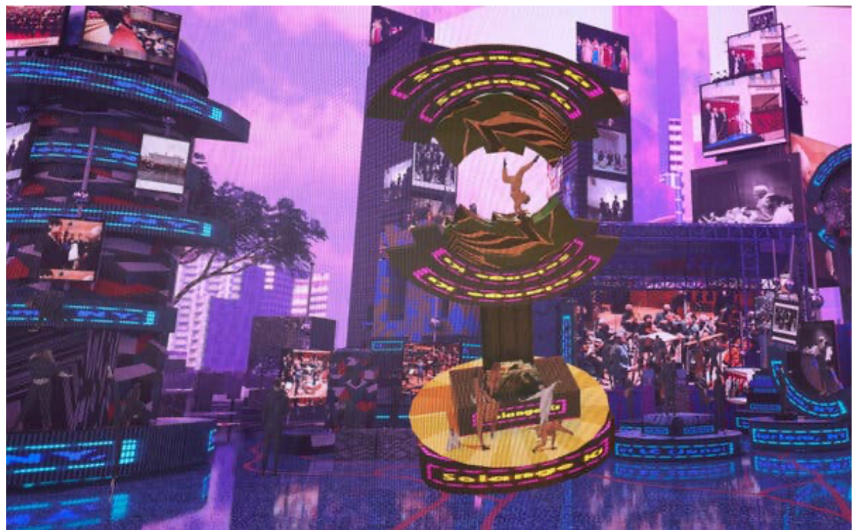
Photo of "An Eclectic Dance to the Music of Time," a video by Jacolby Satterwhite at David Geffen Hall in Manhattan.

"San Juan Heal," Abney's contribution, comprises 35 large vinyl squares ornamenting most of the building's northern facade. Collagelike shapes render an apropos figure, letter or phrase: "Soul at the Center," "San Juan Hill," Thelonious Monk in a red cap. (He lived in the area.) The mixture captures the sometimes dissonant vibrancy of this particular patch of Manhattan; several large letter Xs could stand for multiplying different influences or for the overlooked histories that have been crossed out. But the bold colors and easy legibility, and the way the whole thing makes the building look almost like an educational children's toy, reach out and grab you across Broadway.