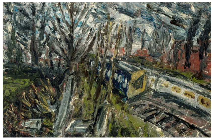
Kossoff's 'Between Willesden Green and Kilburn, Winter Evening' (1991)

In "City Building Site" (1961), the earliest of Kossoff's landscapes displayed, black girders and chrome-yellow cranes rise out of muddy walkways forged in layered slathers of pigment: place and painting seem to come into being simultaneously. Through the 1960s, Kossoff's urban panoramas captured London in flux. Concrete cooling towers soar one bright blue morning amid a maze of railway lines, electric masts, industrial ruins and abandoned allotments in "Willesden Junction, Summer No 2". York Way viaduct slices through derelict wasteland, the gloom mitigated by touches of Venetian red and orange, in "Railway Landscape near King's Cross, Dark Day".