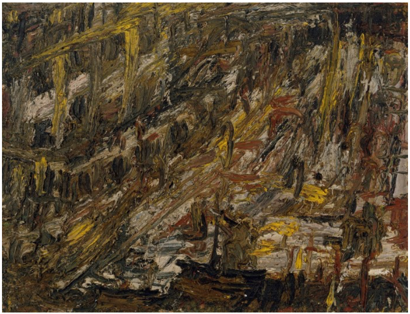
Kossoff's 'City Building Site' (1961)

Among the season's most unlikely, exciting exhibitions is the meeting of the École de Paris and the School of London in Soutine Kossoff at Hastings Contemporary. An impressively ambitious show for a regional gallery, it's the first UK display of Chaïm Soutine's landscapes in four decades, and worth the trip for his frenzied vistas of Céret alone. The paintings are so turbulent that in "Les Platanes à Céret" and "Paysage aux Cypres" it is as if a tornado uproots the houses and trees of the village in the Pyrenees foothills, sweeping you into a vortex of thick, spinning colour. These come from private collections and their survival is remarkable, since Soutine came to loathe his Cérets and subsequently attempted to destroy them.